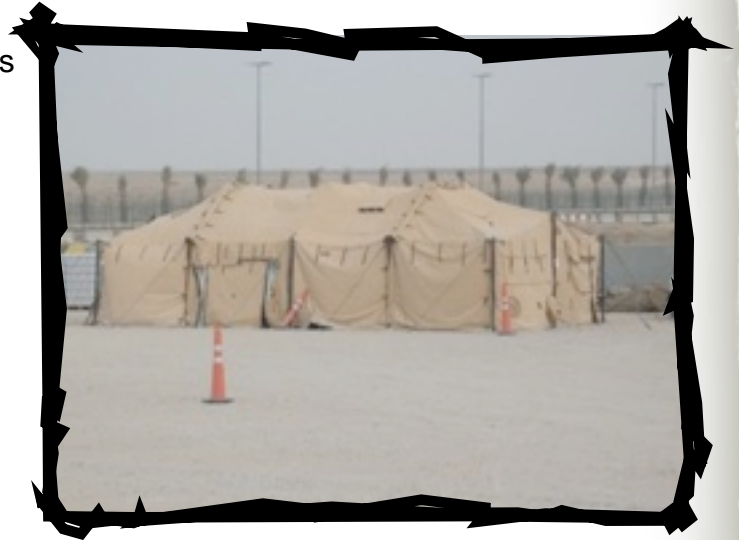
The new tent erected by the 1SB Engineer Section for the APOD, so Soldiers can keep cool while awaiting transport.