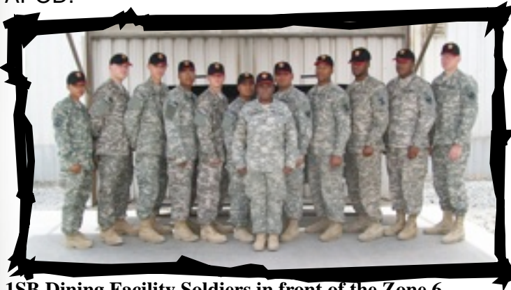
1SB Dining Facility Soldiers in front of the Zone 6 DFAC.