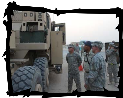
Soldiers of the 164th TB describe the capabilities of the HET to Gov. Patrick at the Convoy Staging Lanes.

happy to see a familiar face from back home and a fellow Red Sox Fan.