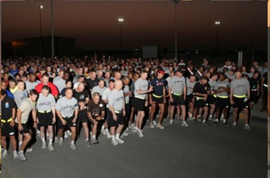
Runners line up at the starting line for the Durable Brigade 9/11 Remembrance Run on Sept. 11, 2010