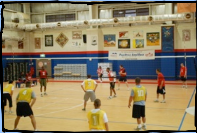
The Special Troops Battalion Volleyball team taking on a rival battalion during the post volleyball tournament.

Hightower-Aguilar. However, with the dedication team STB displays they are still heating up the competition and shaking things out there on the volleyball court.