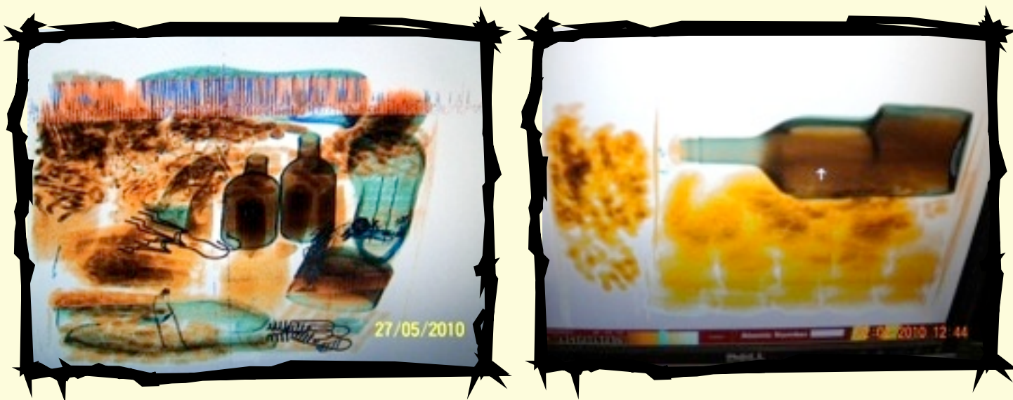
Several screen captures from the Joint Military Mail Terminal's X-ray machine. Suspected violations are reported to the U.S. Army Criminal Investigations Division and are inspected for possible General Order 1 Bravo violations.