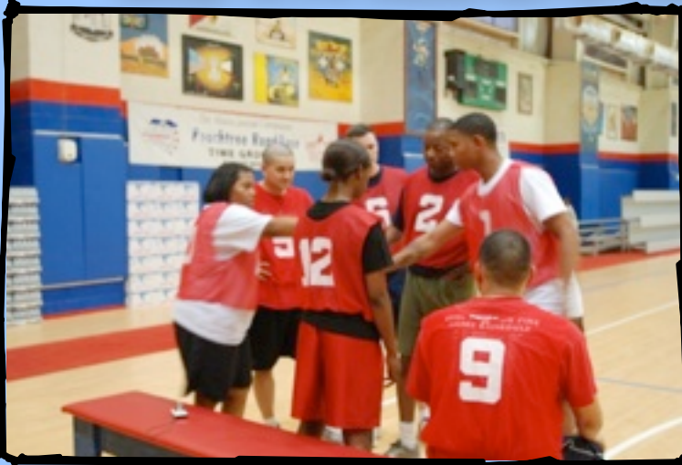
The Special Troops Battalion Volleyball team preparing to go out on the court.