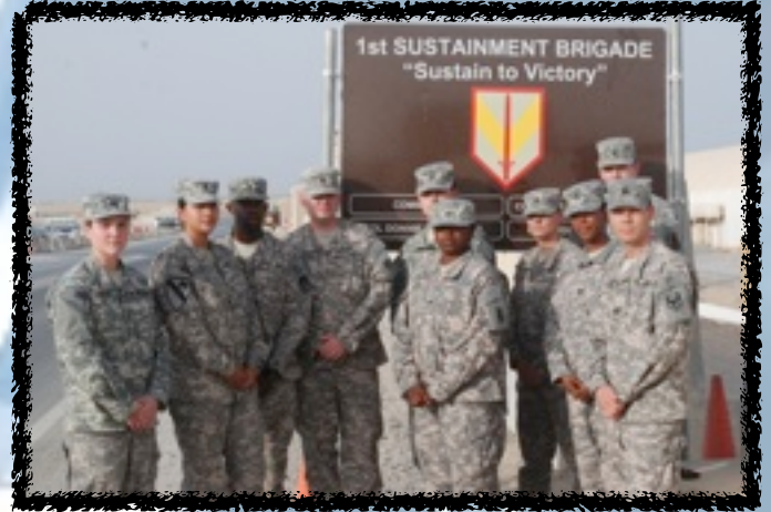
The 1st Sustainment Brigade Legal team.