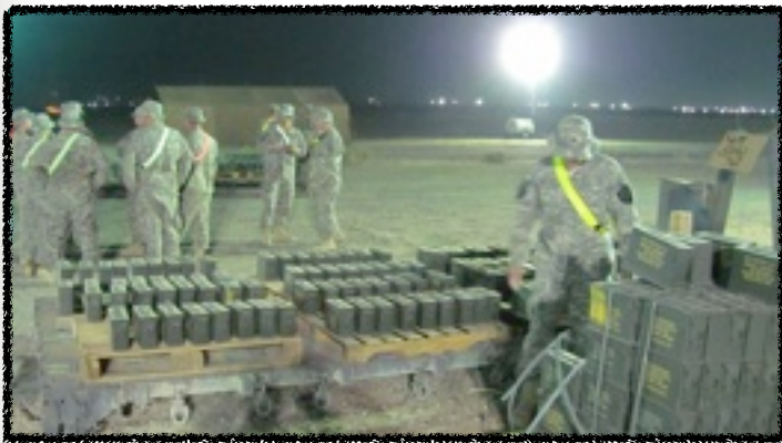
Long before sunrise and hours before the first Strykers arrive, the ammo detail from the 261 st OD CO and 4/2 SBCT set up the class V collection point at Camp Virginia, Kuwait.

Upon arrival, in full view of the media and