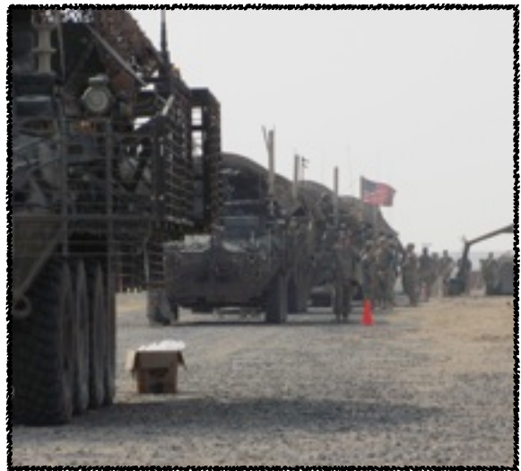
4/2 SBCT Strykers make their way through the supply turn-in stations.