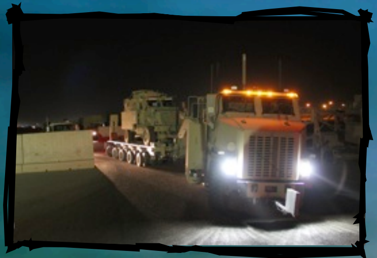
A Heavy Equipment Transporter (HET) hauls a Mine Resistant Ambush Protected (MRAP) vehicle out of Iraq as part of the Responsible Retrograde mission.

Driving was not the only responsibility of the 1166 th Soldiers. They were expected to operate and maintain their own trucks and ensure the equipment arrived safely to its next destination.