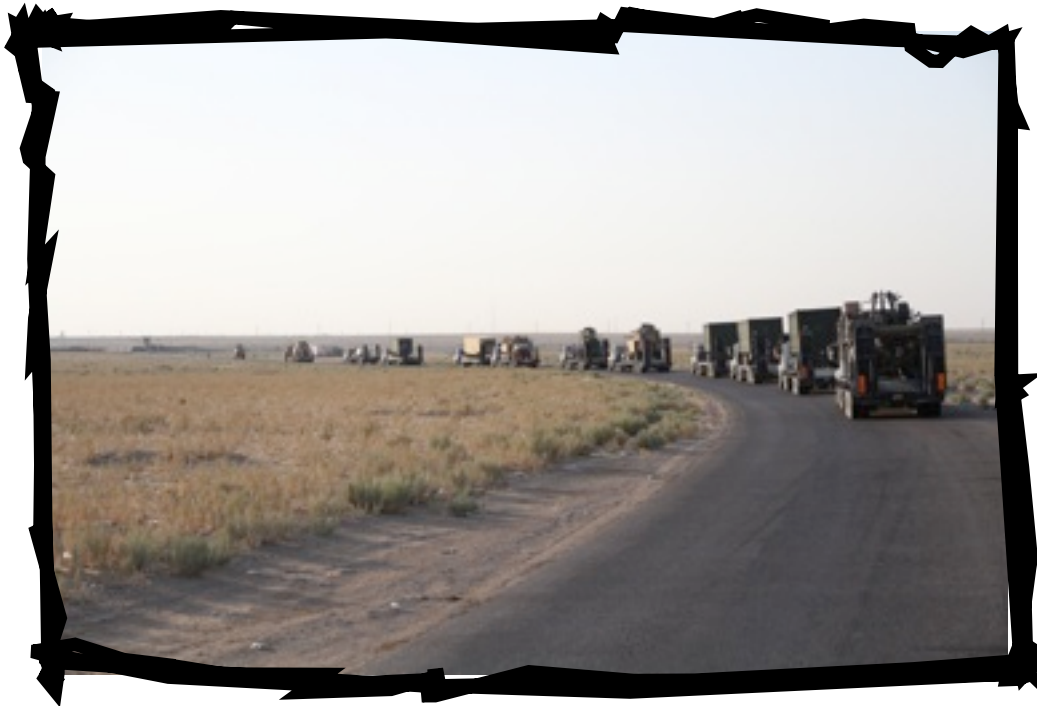
A convoy of Military and contracted line haul trucks move heavy military equipment out of Iraq.

missions. JLTF 7 retrograded over 13,000 pieces of military equipment and traveled over 2.4 million miles with convoys consisting of over 40 vehicles throughout theater. The equipment retrograded consisted of equipment that sustained combat operations such as ammunition, heavy transporting vehicles and up-armored vehicles. "The Task Force was given the mission to retrograde equipment out of Iraq in order to support the Presidential mandate and we have completed that task successfully," said Lt. Col Alfredo M. Versoza, the JLTF 7 commander.