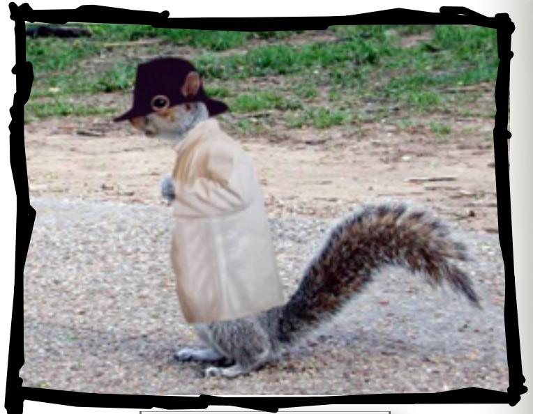
AGENT FISHER, SECRET SQUIRREL