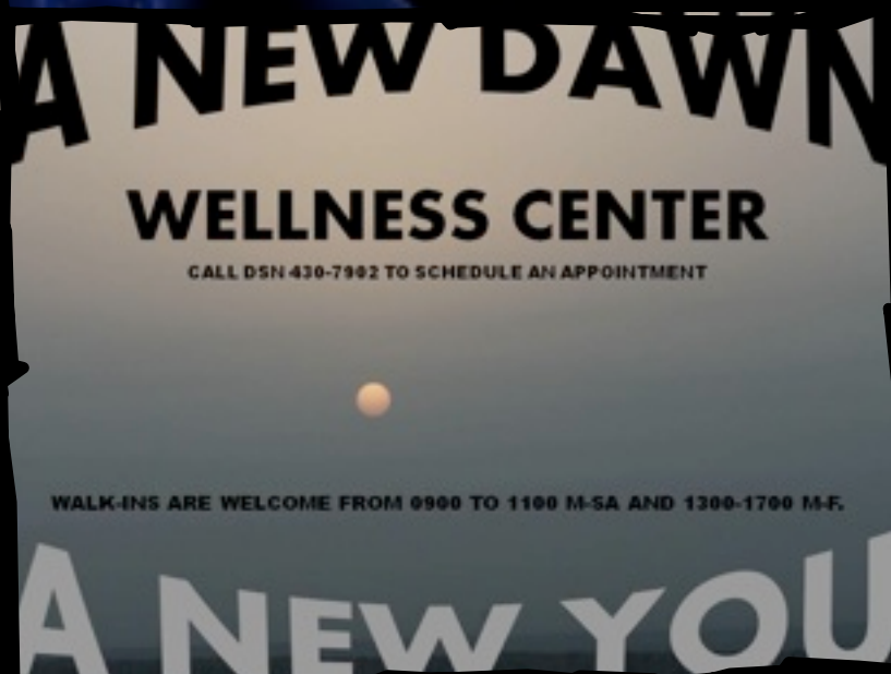
The 1SB Wellness Center provides a measure of comprehensive Soldier fitness. Figure by Maj Dusten MacDonald

Body composition is determined by measuring the relationship of body fat, lean muscle, and hydration levels. This is accomplished through the use of the Body Stat machine. Individual metabolic rate is measured using an indirect calorimeter . This test determines the estimated number of calories an individual uses during normal