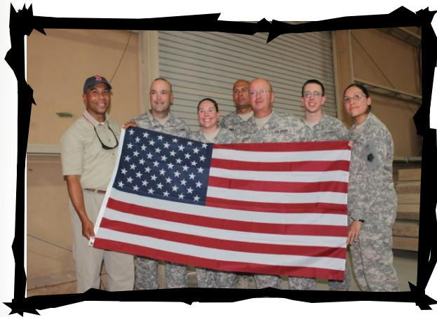
Gov Deval Patrick poses with members of the 164th Transportation Battalion from the Massachusetts National Guard.

On 22 July 2010, Governor Deval Patrick visited the 164th Transportation Battalion at Camp Arifjan, Kuwait. Governor Patrick was completing a tour visiting Massachusetts Soldiers throughout Iraq, Kuwait and Afghanistan. Governor Patrick had also presided over the 164th Transportation Battalion's going away ceremony held at the TD Banknorth Garden in early January, and the 164th was proud to host the Governor for the second time in support of their deployment.