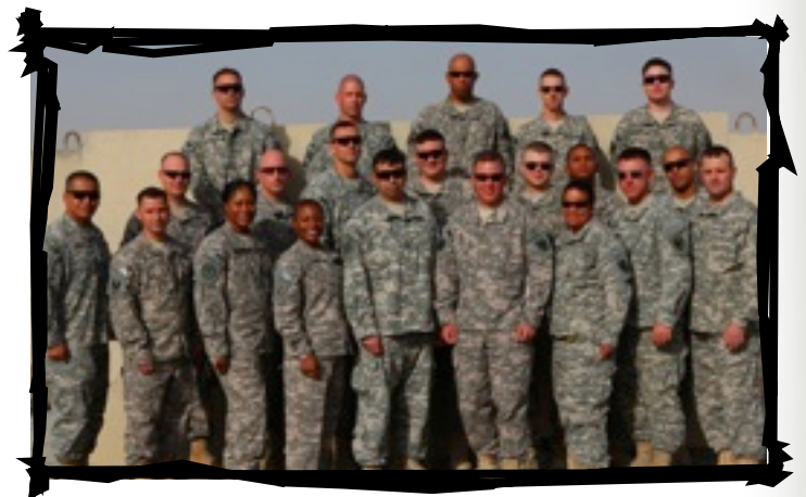
The 1st Sustainment Brigade S3 Shop in front of the 1SB Sustainment Operations Center.

The Army being what it is, resistant to change, has a collective challenge remembering or even accepting the CREW system as an absolute life saving measure equal to the individual weapon. The Electronic Warfare spectrum is one that can't be quantified with simple terms. Our finest moment is when a convoy returns safely with no IED events occurring on its trip.