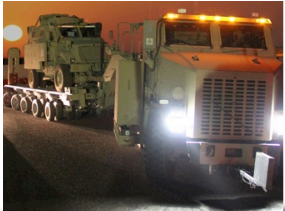
On The Cover: Operation “New Dawn”