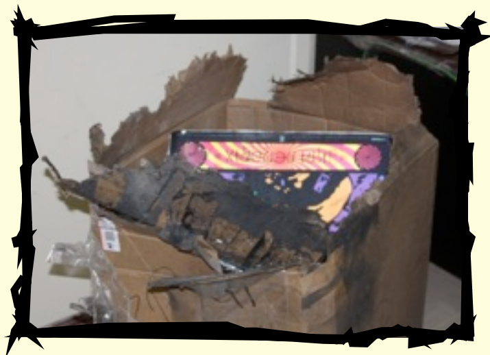
The remnants of a suspicious package after EOD personnel conducted a controlled detonation.

A familiar saying is “ignorance of the law is no excuse.” It is a good time for all personnel to examine General Order 1B (GO-1B) as it pertains to prohibited items. Prohibited items are, by virtue of the restrictions placed on them, non-mailable. GO-1B promotes the readiness of United States personnel by prohibiting items such as alcohol, sexually explicit material and weapons to include small knives. There are also authorized items that fall into the non-mailable category. Theater and postal policies discuss the mailing policies for other items that are not on the prohibited list. Violations disrespect the host nation of Kuwait and can severely threaten the strong bonds service members currently enjoy.