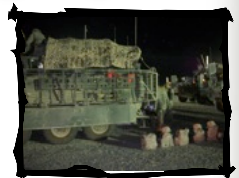
A Stryker from the 4/2 SBCT being processed by the 462nd MCB at Camp Virginia.

As the 4-2 SBCT Stryker convoys crossed the border, many saw the glory, the attention and the spotlight on the convoys as they passed. However, behind the scenes, the Soldiers of the 610 th Movement Control Team were in the thick of it, making essential contributions to this historic operation. The MCT coordinated the movements of northbound convoys and ensured that all four 4-2 ID elements reached the border with ease within the four days. The team successfully hit critical hard times that if not met, would have been detrimental to the entire operation. The team has mastered movement control operations on the border and much of the operations over the span of the operation have been executed smoothly.