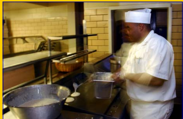
PFC H., a cook with the HHC 1SB, is busy making breakfast for Soldiers.