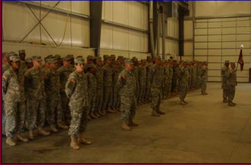
Soldiers and Families of the 24th Transportation Company and the 2-2 HET looked on as six of their fellow Soldiers received promotions.