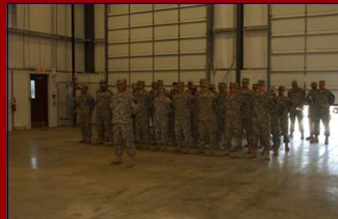
2-2 HET Soldiers look on.