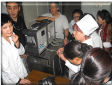
Kyrgyz and American medical personnel on a medical exchange.