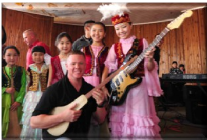
The Sirocco band played six concerts and learned much about Kyrgyz culture.