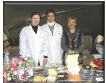
New entrepreneurs sell their Kyrgyz products at the Transit Center