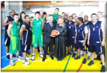
Kyrgyz and US basketball players after an incredible game!