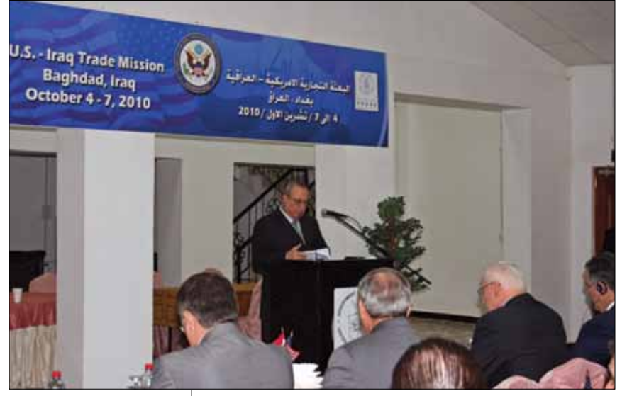
On October 5, 2010, during the trade mission to Iraq, representatives from U.S. companies and Iraqi officials gathered at the U.S. embassy in Baghdad to hear about business opportunities. They later participated in nearly 200 matchmaking meetings with potential business partners.