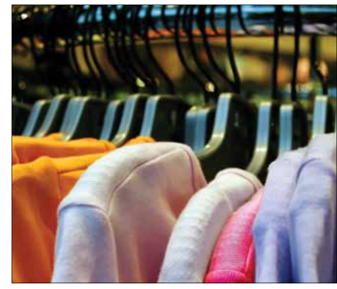
The Western Hemisphere accounts for roughly two-thirds of all U.S. textile and apparel exports—the largest of any market. In 2010, the United States exported nearly $13 billion worth of textiles and apparel to the region.

Efforts such as the pavilion and summit will lead to job creation. Despite all the challenges facing U.S. textile and apparel companies, the industry continues to play an important role in the economy. In 2010, it generated more than $20