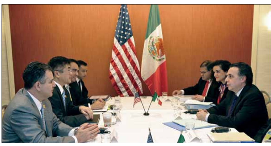
U.S. and Mexican representatives meet in Atlanta, Georgia, November 2010 during the fourth Americas Competitiveness Forum (ACF). Representatives from more than 34 countries are expected to attend the fifth ACF, which will be held October 5–7, 2011 in Santo Domingo, Dominican Republic.

Material in this newsletter may be reproduced unless otherwise noted. When reprinting, please credit the U.S. Department of Commerce, International Trade Administration.