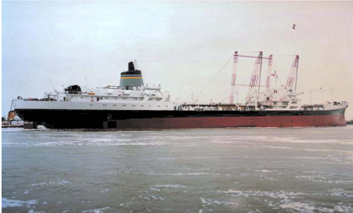
USNS Maumee, the first ship of the class and a sistership of the USNS Shoshone.