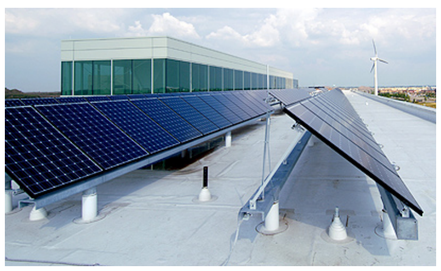
Great River Energy received CREB financing for a wind turbine and solar panels installed at its headquarters building in Maple Grove, Minn.

Prior to the CREB program, created by the Energy Policy Act of 2005, not-for profit cooperatives' inability to take advantage of the PTC had hampered their efforts to develop