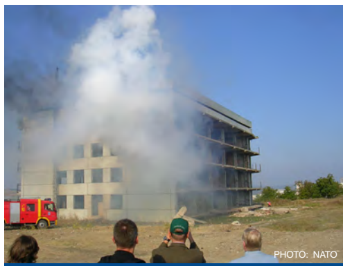
August-September 2011: The CODRII disaster response exercise in Moldova.

The Working Group's second annual meeting took place in Boston in July 2011. The co-chairs agreed to a 2011-2013 work plan and experts discussed a whole-community approach to disaster preparedness and response. They also held a panel discussion on lessons learned from recent international disaster responses, including the Haiti earthquake of 2010 and the Japan earthquake and tsunami of 2011. In addition, the Working Group discussed experiences from the 2010 Russian wildfires as well as current trends and opportunities for cooperation in the field of mass transportation security. In September 2011, EMERCOM participated in the Asia-Pacific Economic Cooperation (APEC) meeting of the Emergency Preparedness Working Group,