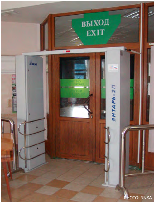
A pedestrian radiation portal monitor installed at the Pogranichny (Grodekovo) Rail Station on the Russian border with China.

Serbia and Ukraine. Two U.S.-Russian seminars were organized to exchange experiences on design, exploitation and support for security of fast-neutron research reactors and on waste management in the United States and Russia.