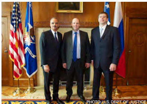
From left: U.S. Attorney General Holder, Russian Deputy Justice Minister Lyubimov, and Russian Minister of Justice Konovalov.

In May 2011 in Deauville, France, the Presidents of the United States and Russia announced the establishment of the Bilateral Commission’s Rule of Law Working Group to promote enhanced bilateral cooperation on legal issues between the U.S. Department of Justice and Russian Ministry of Justice. U.S.