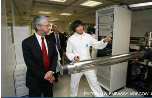
Dr. John Holdren during his March 2011 visit to Moscow.

meetings, as well as individual meetings and videoconferences.