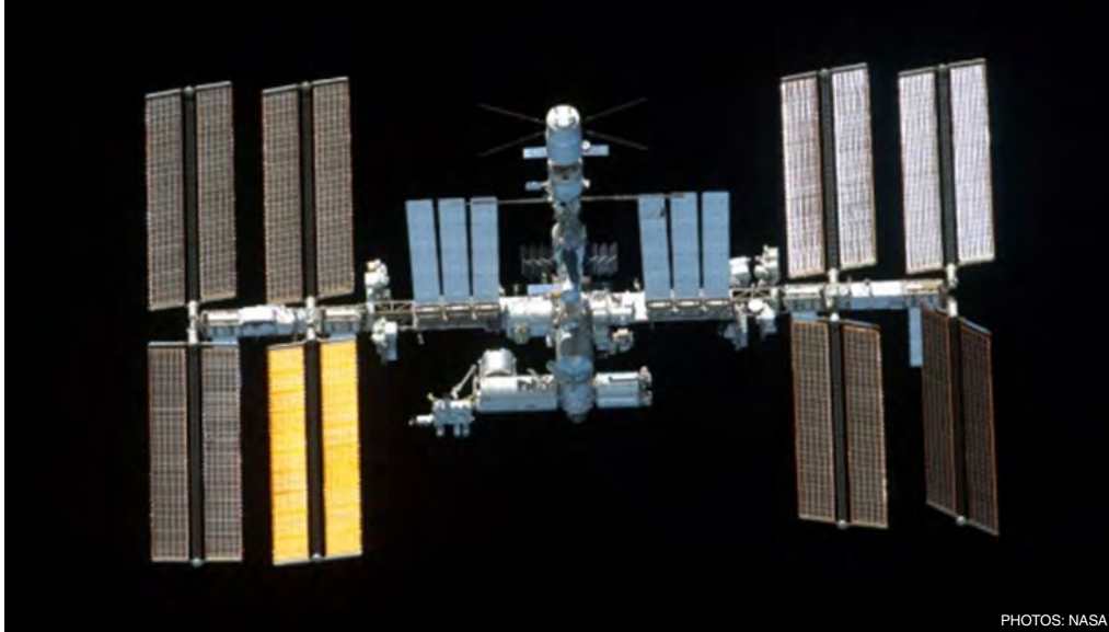
The International Space Station (ISS), as photographed by the STS-134 crew on the space shuttle Endeavour in May 2011.

space exploration beyond low-Earth orbit, the Working Group noted discussions within the multilateral International Space Exploration Coordination Group.