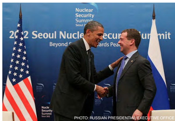
President Obama and President Medvedev meet on March 26, 2012 during the Nuclear Security Summit in Seoul, South Korea.

Combined U.S. and Russian efforts to strengthen bilateral economic cooperation helped to secure an invitation for Russia to join the World Trade Organization (WTO). Two-way trade and investment increased with Boeing aircraft sales to Aeroflot and UTAir, Rosneft's joint venture with ExxonMobil to explore Arctic oil and gas fields and to increase Russian investment in Texas, and with joint ventures between General Electric and Inter RAO UES and Rostekhnologii.