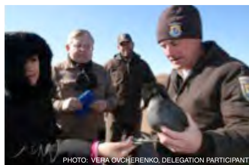
December 2011: Russian environmental experts visit Bosque del Apache National Park, New Mexico, an important location for migratory birds including geese from Wrangel Island, Russia.

(APEC) Environment Ministerial. The Working Group will develop proposals on e-waste and explore expanded collaboration on hazardous and solid waste (management, storage, and clean-up). We seek to deepen ties on environmental crime through additional joint Department of Justice and Ministry of Justice programming. Wildlife and habitat conservation, protected area management, and forest-related cooperation provide the backbone for our joint environmental cooperation and we intend to expand related exchanges and programs, particularly in our shared Beringia region.