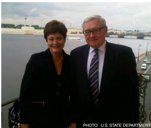
Arms Control and International Security Working Group Co-chairs in St. Petersburg in August 2011.

The Working Group met in a full interagency plenary format in January and December 2011 in Washington D.C., and in August 2011 in St. Petersburg. A wide range of issues was discussed, including strategic stability, missile defense, space, WMD nonproliferation challenges, and conventional arms control in Europe. In addition, regular meetings of the two co-chairs were held, mainly focusing on the issues of missile defense and strategic stability.