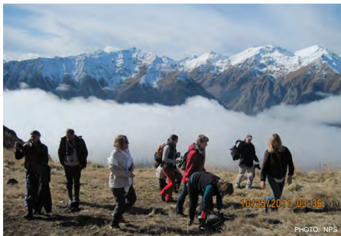
The Caucasus State Nature Reserve brought a U.S. delegation to an important habitat in the Reserve's core in order to discuss wildlife management issues.

Partnership in Petropavlovsk-Kamchatskiy in July, as well as other U.S. delegation visits to several joint projects in the Russian Pacific. There was also involvement in the 2011 Beringia Days Conference in Alaska, plant genetic verification initiatives, workshops on illegal logging co-hosted by U.S. Department of Justice and Russian Ministry of Justice, Environment Protection Agency (EPA)-led workshops on waste and black carbon, and two park manager exchanges supported by MNRE, the National Park Service (NPS), Fish and Wildlife Service (USFWS) and U.S. Forest Service (USFS). The joint MNRE-EPA workshop on black carbon and the workshops on the U.S. Lacey Act exemplify a new, unprecedented level of cooperation. In particular, the following questions were discussed: the scientific assessment of the state of current research into the pollution of Arctic territories in the United States and Russia with black carbon; emissions of black carbon from stationary diesel generators in the Arctic; and the preparation and carrying out of joint demonstration projects aimed at black carbon reduction. Carrying out the agreement reached during the November 2010 Tiger Forum, Russian and U.S. specialists