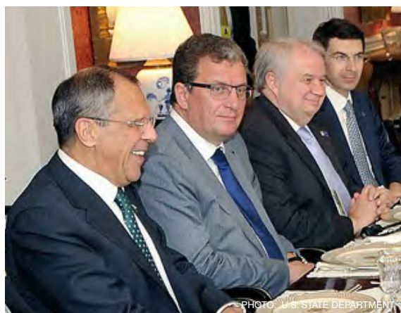
From left: Foreign Minister Sergey Lavrov, Presidential Aide Sergey Prikhodko, Ambassador Sergey Kislyak, and Minister of Communications Igor Shchegolev at the Blair House in Washington, D.C., June 2010.

Perhaps the Commission's most important work this year has been on the people-to-people front. A new agreement will make multiple-entry, three-year visas the norm for American and Russian businesspeople and tourists. Another agreement will increase protection for inter-country adopted children and strengthen adoption procedures. A joint U.S.-Russia protocol on global polio eradication signed in 2011 resulted in joint efforts to help tackle polio outbreaks in Central Asia. Public-private partnerships increased. One example of use of new technologies