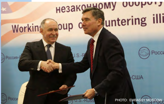
March 2011: Director Kerlikowske (on the right) and Director Ivanov shake hands after a meeting of the Counternarcotics Working Group.

Enforcement Network, the Drug Enforcement Administration (DEA), the Substance Abuse and Mental Health Services Administration, and the National Institute on Drug Abuse (NIDA). The Russian Federation is represented by the Ministries of Internal Affairs, Justice, Foreign Affairs, Health and Social Development; the Federal Financial Monitoring, Federal Customs, Federal Migration, Federal Security Services; the Supreme Court, the Federal Agency for Development of the State Border, the V.P. Serbsky State Scientific Center for Social and Forensic Psychiatry, and the Office of the Prosecutor General.