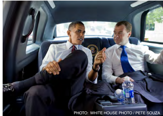
President Obama and President Medvedev ride together to lunch during President Medvedev's June 2010 visit to Washington, D.C.

will turn our attention to advancing Russia's bid to join the OECD and leveraging innovation to bolster the competitiveness of our companies and workforces. And we are confident that the Commission's work will continue to benefit all Americans and Russians as we seek ways to increase our educational and professional exchanges, to find new avenues of cooperation in the public health and other social sectors, and to bring civil society actors together to discuss common challenges. The United States and Russia commit to take full advantage of the Commission's capabilities to advance common interests and unlock the creative and entrepreneurial potential of our societies in the months and years ahead.