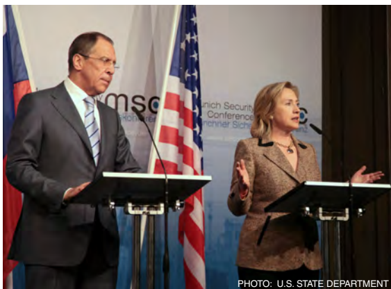
February 2011: Secretary Clinton and Foreign Minister Lavrov address the media after bringing the New START Treaty into force in Munich, Germany.