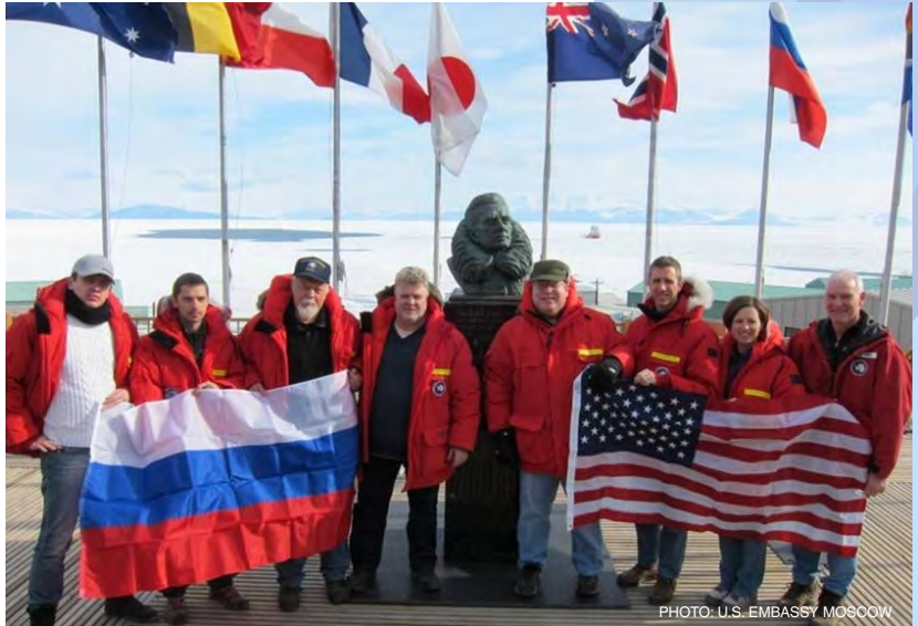
United States and Russian Federation Joint Inspection in Antarctica, January 2012.

In 2011, the Working Group made progress toward the deepening of cooperation between the United States and the Russian Federation in the cross-boundary Bering Strait region with the goal of expanding interaction between protected areas in Alaska and Chukotka. In addition, there was Working Group participation in the Russian-American Pacific