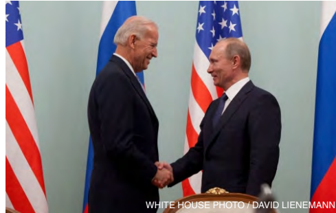
Vice President Joe Biden greets Russian Prime Minister Vladimir Putin at the Russian White House, in Moscow, Russia, March 10, 2011.

William Burns and Sergey Ryabkov used the opportunity afforded by the Presidential Commission to discuss the recent urgent challenges to international security derived from the turbulent developments in North Africa and in the Middle East, Afghanistan and in Northeast Asia. This channel of communication has proven its effectiveness and helped promote a deeper dialogue between the United States and Russia, both on the bilateral level and in multilateral fora.