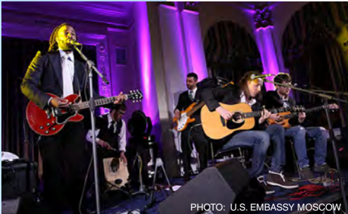
John Forté and his band begin their Russia tour at Spaso House in Moscow.

awards in science and technology. Acting on an idea that originated in the Education sub-working group, Kazan State Technological University hosted the first International Fulbright Summer School in Nanotechnology.