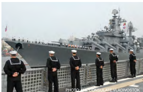
June-July 2011: Sailors man the rails as the USS FORD (FFG-54) pulls into the Port of Vladivostok next to RFS Varyag, flagship of the Russian Pacific Fleet.

The second annual plenary session in Saint Petersburg, Russia in May 2011 culminated in a new Memorandum of Understanding on Counterterrorism Cooperation between the U.S. Department of Defense and the Russian Ministry of Defense. This memorandum is being fully operationalized through bilateral discussions in the Combating Terrorism sub-working group and through the Military Cooperation Work Plan. The bilateral exercise "Crimson Rider" in August 2011 simulated nuclear warhead ground transport. In addition, the Air Force Global Strike Command and 20th Air Force, with support from the Defense Threat Reduction Agency, hosted a static display at Francis E. Warren Air Force Base demonstrating transport and security equipment used by U.S. security forces. Russian presentations highlighted similar practices by Russian military forces. Also in August 2011, in conjunction with the North American Aerospace Defense Command (NORAD) the second annual "Vigilant Eagle" exercise took place, which focused on joint actions during a terrorist hijacking of an aircraft over the Bering Sea and explored possibilities for cooperation between the United States and Russia. In October 2011, the U.S. and Russian Navies successfully completed the "Pacific Eagle" exercise with the goal to improve maritime relations between our two countries and enhance interoperability, particularly in the area of anti-terrorism and counter-piracy operations.