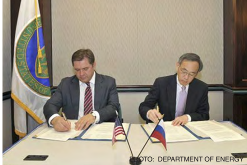
July 2010: U.S. Secretary of Energy Steven Chu and Russian Minister of Energy Sergey Shmatko sign the Energy Working Group Joint Statement on future cooperation.

to implementing “smart grids” in Russia’s power and electricity market. In St. Petersburg, the Energy Efficiency in Public Buildings Initiative is assisting the municipality to improve efficiencies as mandated by Russian federal legislation. In order to develop cooperation on increasing energy efficiency and the level of energy management in public buildings in Russia, a meeting memorandum between the St. Petersburg Administration and the U.S. company Honeywell was signed on September 29, 2011. In accordance with this agreement, the two sides will identify potential sites suitable for a project to increase energy. Additionally, an Energy Efficiency Trade Mission designed to promote business-to-business links in the area of clean energy took place in December 2011. Leaders from 16 small and medium-sized companies from Belgorod, Yakutia, Chelyabinsk, St. Petersburg, and Kaluga traveled to Austin and San Diego to meet with their U.S. counterparts. A second, reciprocal energy efficiency trade mission to Russia for U.S. small and medium-sized companies is planned for June 2012. The planning process has started for a joint pilot project in Yakutia that will assess emissions inventories, find point-source emissions, and develop technology for mitigation of black carbon, a known short-term climate forcing agent.