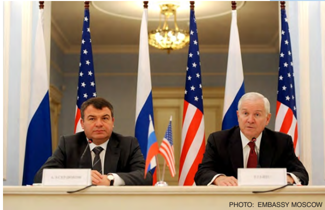
March 2011: Secretary Gates and Minister Serdyukov chair a meeting of the Working Group in Moscow.

The Defense Relations Working Group provides an unprecedented opportunity to conduct open discussion and share information on a broad range of issues and strengthen defense and military cooperation. Receiving senior-level support, the sub-working groups have made significant progress towards increased mutual understanding between military establishments and facilitated positive