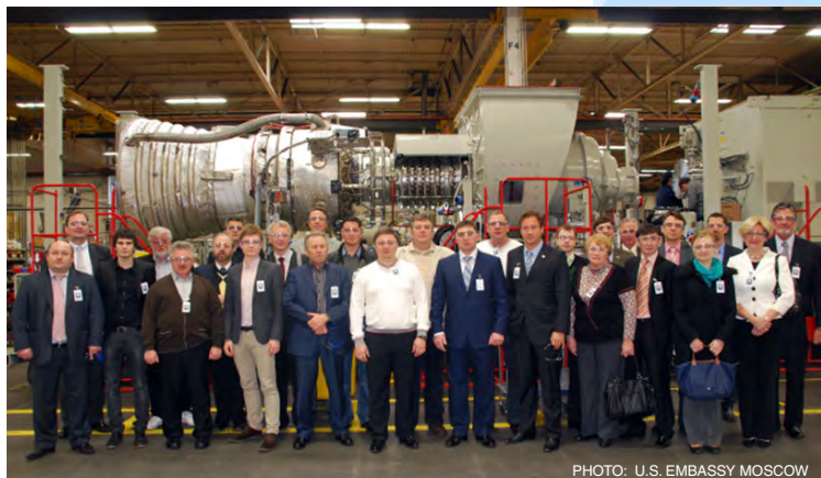
December 2011: Leaders from Russian small and medium-sized companies visit the United States.

The Commission’s Energy Working Group, co-chaired by U.S. Secretary of Energy Steven Chu and Russian Minister of Energy Sergei Shmatko, promotes enhanced U.S.-Russia energy cooperation. It brings together the efforts of the U.S. Departments of Energy, State, and Commerce, the Environmental Protection Agency (EPA), and the U.S. Agency for International Development (USAID), and also the Russian Ministry of Energy, the Russian Academy of Sciences, and the Russian Energy Agency. In order to spur innovation and scientific development needed to address today’s shared energy challenges, the co-chairs have agreed upon a Joint Action Plan for 2012 that aims to broaden cooperation in the areas of energy efficiency, clean energy technology development, and energy security.