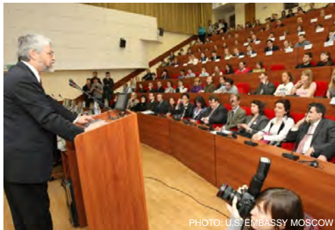
March 2011: Dr. John Holdren addresses students at Bauman State University.

In May 2011, Russia hosted a successful meeting on international nanotechnology standards, and the U.S. National Institute for Occupational Safety and Health (NIOSH) is teaming up with the Far Eastern Federal University and Kazan University to upgrade the study of nanotoxicology and promote international cooperation. For the first time the Russian Ministry of Education and Science participates as a partner agency in the U.S. National Science Foundation Partnerships for International Research and Education (PIRE) program. Seven interdisciplinary proposals involving U.S.-Russia collaborations were submitted to the NSF PIRE competition.