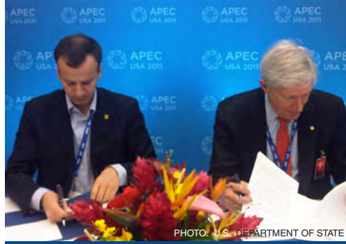
November 2011: Arkadiy Dvorkovich and Robert Hormats sign the Statement of Intent on future cooperation in the field of innovation.

Another priority area of the Working Group's activity is cooperation in identifying policies and practices that support the development of successful innovation centers and regional innovation clusters. At the Working Group's inaugural meeting, Russia's Association of Innovative Regions of Russia will participate in a discussion on the American experience in supporting clusters and approaches to future cooperation in this sphere. In the longer term, the Working Group intends to explore possible partnerships between American and Russian innovation centers and clusters.