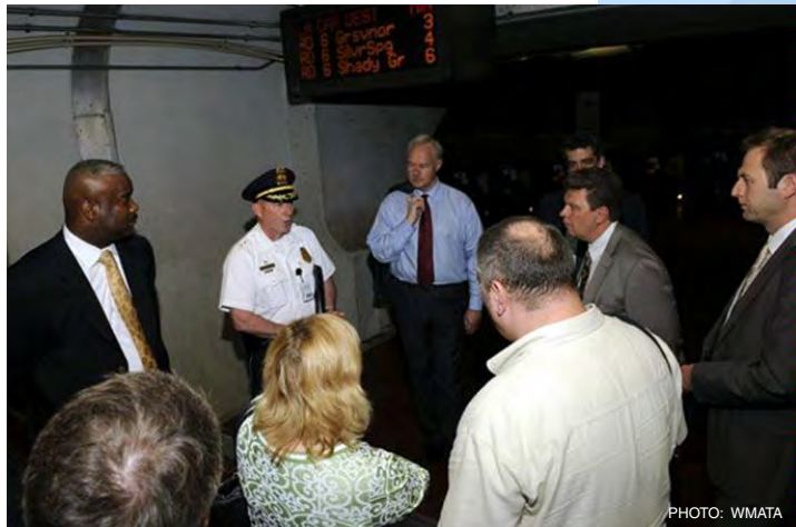
May 2010: A Russian delegation conducted site visits to the Washington Area Metro Transit Authority to watch a counterterrorism exercise, and the Transportation Security Administration Operations Center in Herndon, Virginia. Here, Russian transportation security authorities are briefed on the Rail Safe Operations Exercise at Washington, D.C.'s Union Station.

In May 2011, our two countries' Presidents reaffirmed a common assessment of the threat to global security posed by al-Qa'ida and made a commitment to close cooperation to disrupt, dismantle, and defeat this terror-