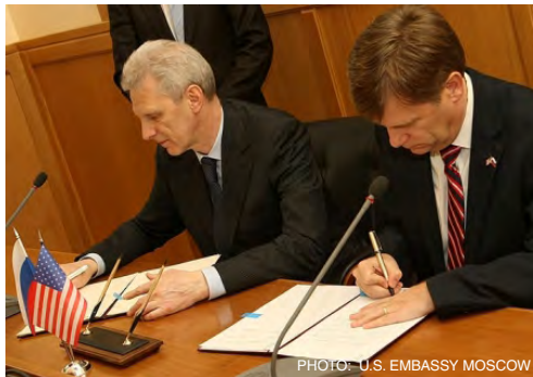
February 2012: Russian Minister of Education and Science Andrei Fursenko and U.S. Ambassador Michael McFaul sign an MOU to pave the way for future U.S.-Russian academic exchanges.

In addition, our bilateral youth sports exchanges will ramp up in 2012, with American ice hockey players and swimmers coming to Russia and Russian beach volleyball players traveling to the United States. We will launch the first U.S.-Russia Virtual Science Challenge for Youth, pairing up U.S. and Russian high school students in an online science contest. The young media professionals exchange will launch in April in both countries. Consistent with our Presidents’ vision for U.S.-Russia relations, the Education, Culture, Sports, and Media Working Group continues promoting new dialogue, understanding, and people-to-people ties.