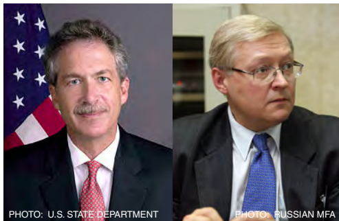
U.S. Deputy Secretary of State William Burns (left) and Russian Deputy Foreign Minister Sergey Ryabkov (right).

The co-chairs share the intention to intensify the joint efforts of U.S. and Russian agencies, business, scientific, cultural, and public circles, extending them to new areas, so as to give the Presidential Commission a truly universal character and to increase its effectiveness. The goal is to build up a multifaceted partnership between the United States and Russia, based on the purposes and principles of the U.N. charter.