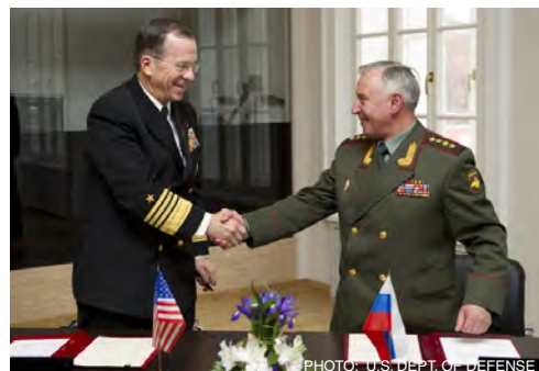
May 2011: Admiral Mullen and General Makarov congratulate each other on signing an MOU on combating terrorism in St. Petersburg.

The Commission's Working Group on Intelligence Cooperation was created in March 2010 during the visit of then-Director Leon Panetta of the U.S. Central Intelligence Agency (CIA) to Moscow to meet Russian Foreign Intelligence Service (SVR) Director Mikhail Fradkov. Both Secretary Clinton and Foreign Minister Lavrov hailed the new Working Group subsequently as a means "to strengthen our common security." Then, now, and going forward, our two countries' premier intelligence agencies will continue to cooperate on a bilateral basis in areas of mutual concern and security.