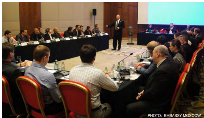
April 2011: Russian and American law enforcement agencies gathered in Moscow to share expertise on illicit narcotics financing.

In the third area of ongoing cooperation, the two sides have worked together to improve legal standards, administration, and criminal prosecution for crimes involving narcotic drugs. Working Group members studied the U.S. system of drug courts, which informed the subsequent drafting of legislation to establish similar courts within Russia. Both sides also discussed how to strengthen law enforcement cooperation and support critical institutions in Central Asia, a transit region for the illicit narcotics industry.