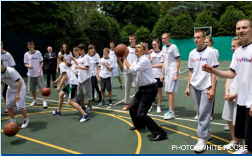
President Barack Obama takes a shot alongside Russian youth sports visitors on the White House basketball court, May 2010.