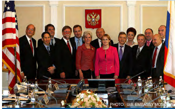
April 2011: Secretary Sebelius and Deputy Minister Skvortsova head their respective delegations at the Health Working Group meeting.

biomedical research to tobacco control programs.