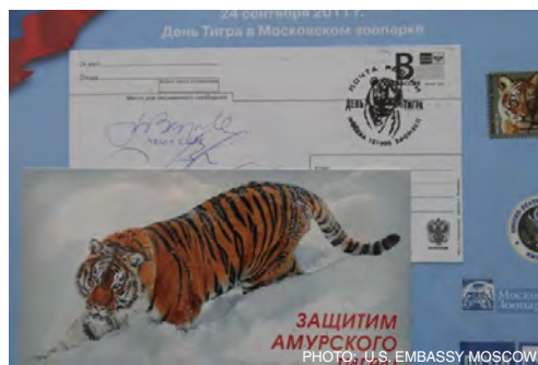
September 2011: A scene from Tiger Day at the Moscow Zoo.

Upcoming milestones for the Working Group are the expected signing of a memorandum of understanding for cooperation in the Antarctic and the establishment of a sister park arrangement across the Bering Strait. We will continue to work on important issues bilaterally and in multilateral fora such as the Arctic Council. Other major events include the next Working Group plenary session, the U.S.-Russia Polar Bear Commission meeting, and the Asia-Pacific Economic Cooperation