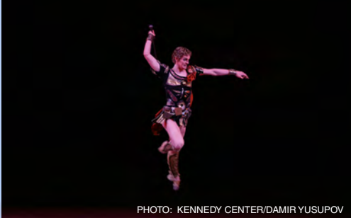
From Spartacus , as performed by Moscow's Bolshoi Ballet at the Kennedy Center in Washington, D.C., February 2010.