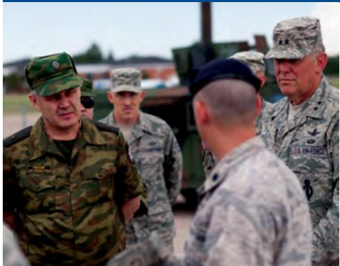
August 2011: U.S.-Russian collaboration in action during exercise CRIMSON RIDER 2011.

Throughout 2011, the United States and Russia completed a total of 51 Work Plan and non-Work Plan events, exercises, and exchanges. Among them were the Joint Staff Talks that took place on November 12-16, 2011. The talks focused on the military-political situation in crisis regions (North Africa, Middle East, Afghanistan, and Asia-Pacific), and the current conditions and future development of bilateral military cooperation. The Russian side briefed U.S. participants on the strategic exercise “TSENTR-2011.” The U.S.-side also hosted the Russians at the U.S. Army’s Maneuver Warfare Center of Excellence at Fort Benning, Georgia.