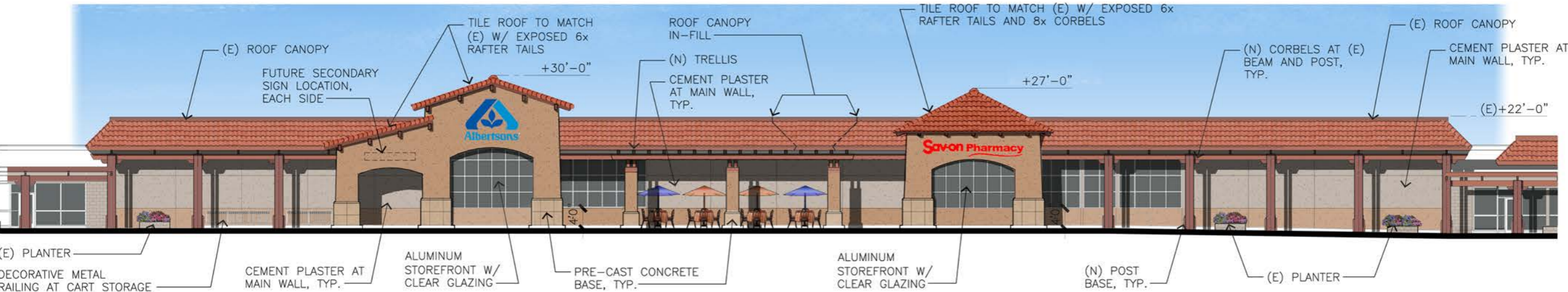
OPTION A1: PROPOSED ALBERTSONS ELEVATION SCALE: 1/8" = 1'-0"