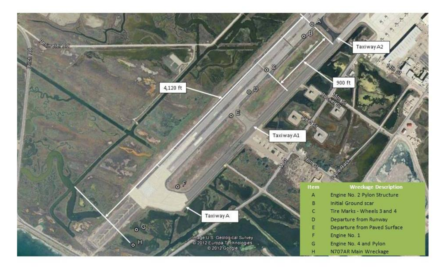
Figure 2. Aerial photograph of the debris field.

As shown in figure 2, a 4,120-foot debris field began about 7,500 feet from the approach end of runway 21, near taxiway A2. Main landing gear tire marks indicated that the airplane regained contact with the runway about 900 feet into the debris field, departed the runway on a 218° heading near taxiway A1, and continued across the grass infield and taxiway A before coming to rest in a saltwater marsh where it caught fire. The first pieces of wreckage found along the debris path were a fragment of the No. 2 engine pylon torque bulkhead and a piece of the No. 2 pylon overwing fitting, located just past taxiway A2. The No. 1 engine nose cowl was found in the grass infield near taxiway A about 450 feet further into the debris field and left of the runway surface; it exhibited crush damage consistent with contact with the No. 2 engine. The No. 2 engine nose cowl was located near the runway arresting gear on the left side of the runway at the 8,500 foot point. The No. 2 engine was found about 230 feet further, on the left side of the runway surface. Intermittent scrape marks leading to the No. 2 engine were observed on the runway beginning about 7,800 feet, consistent with the engine tumbling after separating from the wing.