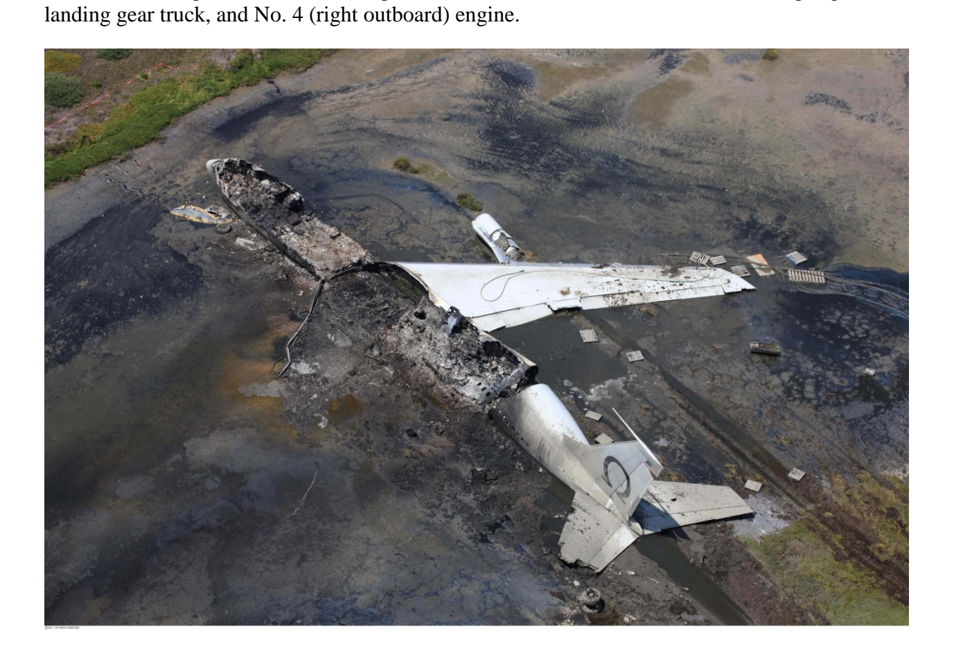
Figure 3. Aerial photograph of airplane wreckage.

Fire consumed the top of the cabin and the cockpit (see figure 3). The main wreckage, which came to rest in the wetland marsh, consisted of the cockpit and cabin; the right wing with the No. 3 (right inboard) engine partially attached; the empennage; and the inboard half of the left wing, which sustained thermal damage and was submerged in water. Scattered debris aft of the main wreckage included the nose gear, remnants of the burned outboard left wing, right main