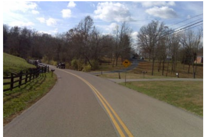
KYTC installed high friction surface treatments at locations with a history of wet roadway departure crashes.