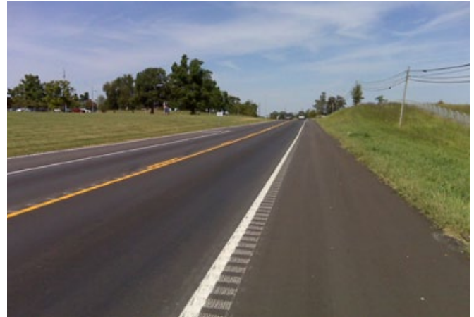
KYTC is installing hundreds of miles of rumble strips/stripes in conjunction with its pavement resurfacing program.

Increasing friction on roadways with a history of wet weather crashes has been proven to yield significant safety benefits. Kentucky has selected 32 sites to apply high friction surface treatments.