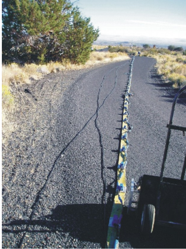
Figure 16. Photo. Land Streamer deployed above Golden Dome Cave.