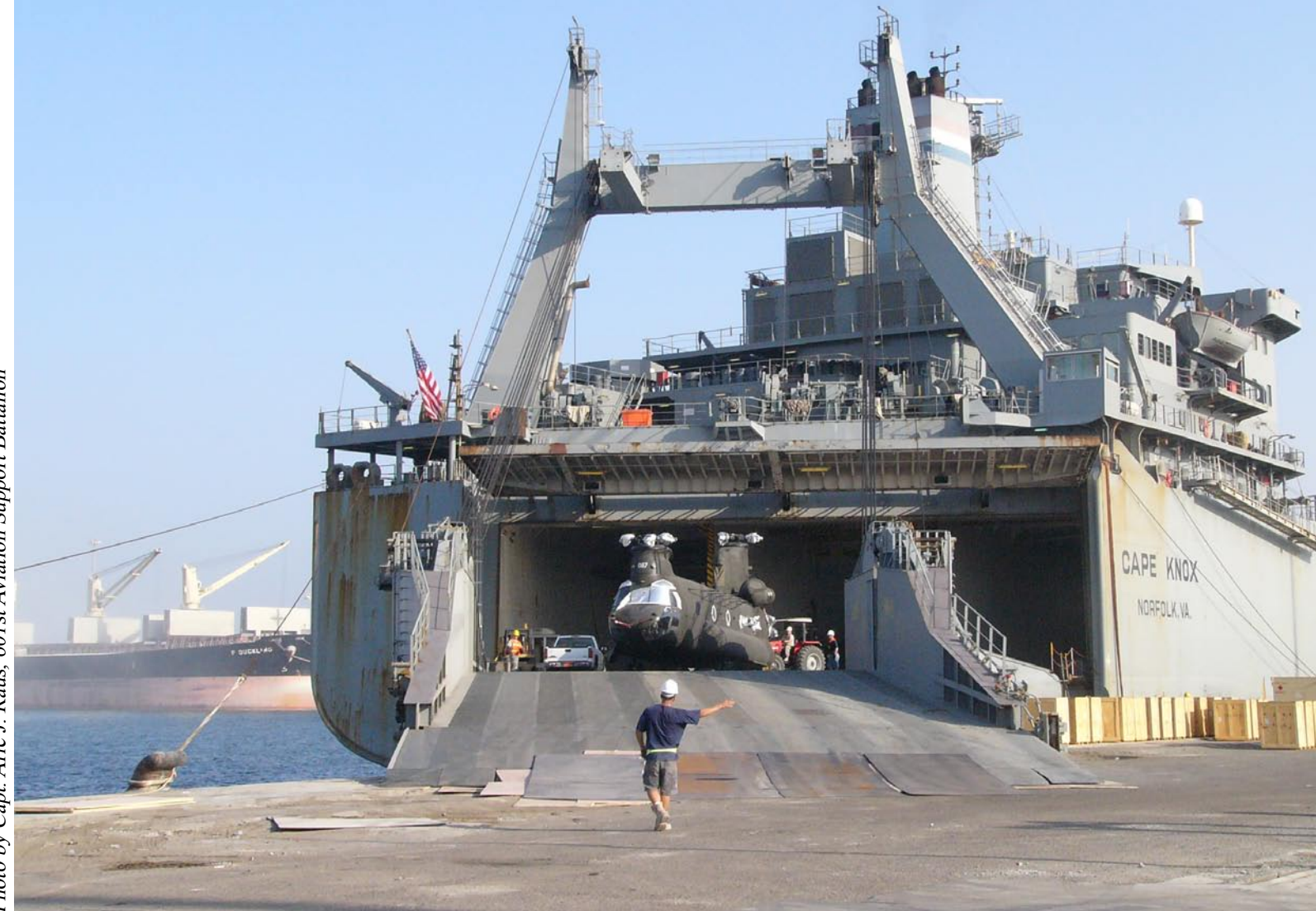
Port workers in Kuwait download a CH-47 Chinook from the the Cape Knox