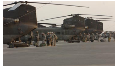
Piling on CAB packs Soldiers tight on maiden mission

16 | CHOKEPOINT The Fighting Eagles stop cranes and criminals alike when 2-1 sets up an impenetrable chokepoint during a force protection exercise