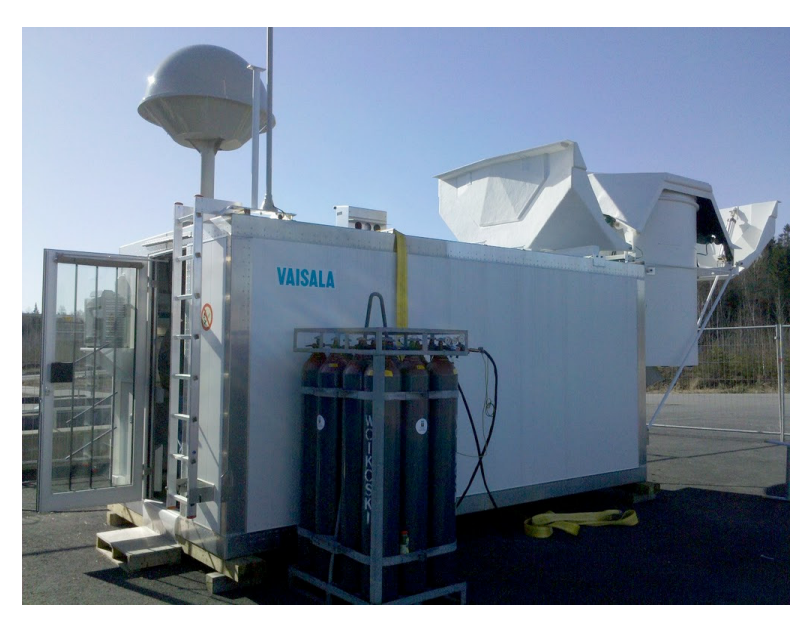
Figure 2. Vaisala AS13 Autosonde to be installed at NSA C1.

The Vaisala AS13 Autosonde will be installed at the NSA C1 site in Spring 2011 (see Figure 2). The Autosonde is an automatic weather balloon launcher that allows up to 24 radiosondes to be released without the need for personnel. The introduction of the Autosonde aims to increase the reliability of radiosonde launches in harsh environments, such as the NSA.