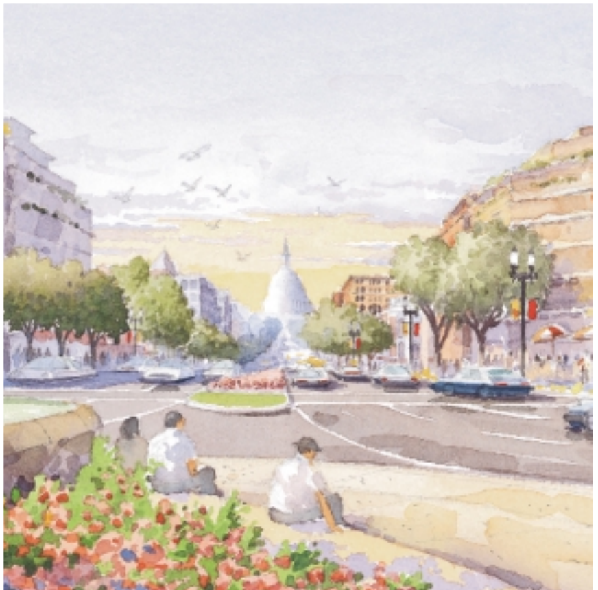
Clockwise, from upper left: South Capitol Street • New bridge linking Anacostia and East Capitol Street • North Capitol Street at New York Avenue • Possible Supreme Court site on South Capitol Street