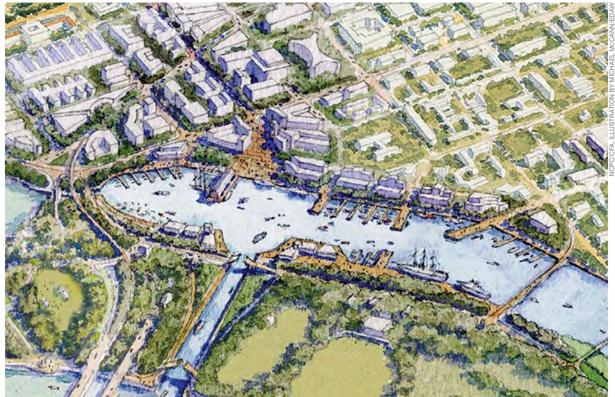
Potomac Harbor can become a unique destination for water-oriented recreation in the nation's capital, complementing the proposed urban mixed-use neighborhood north of the channel.

NCP/CFR, ILLUSTRATION BY MICHAEL MCCANN/VEDAW