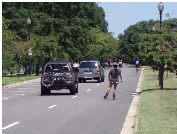
Current conflicts exist among pedestrians, cyclists, and vehicles.

The sinking seawalls and walkway along the Potomac River edge of the park should be reconstructed, raised, and widened to reduce the impact of periodic flooding and to create a pleasant and welcoming esplanade. The scenic beauty of the esplanade would enhance the setting of future memorials and could be enjoyed by those choosing to stroll, fish, read, or picnic. More active users, such as bikers and skaters, could enjoy the waterfront views and breezes along a parallel path. In addition, a slight realignment of a portion of Ohio Drive along the Potomac River would allow a segment of the linear park to be expanded to create a waterfront open space for gatherings, and support uses such as restrooms and food service.