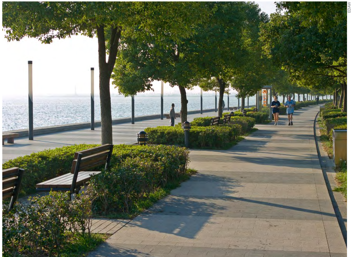
A beautiful esplanade along Potomac Park's shoreline could offer places for commemoration and recreation. (Jinji Lake, China)

Along the southern end of the Washington Channel, the esplanade should be designed as a boardwalk through the new marshy riparian edge. The boardwalk could also extend across the channel at an appropriate distance from the shoreline around Fort McNair to connect Hains Point to the Anacostia Riverwalk. This connection would significantly reduce the number of large boats traveling near Fort McNair and close a