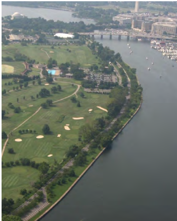
Potomac Park was newly created using fill dredged from tidal marshes in the late 19th century. Long Bridge initially traversed the park.