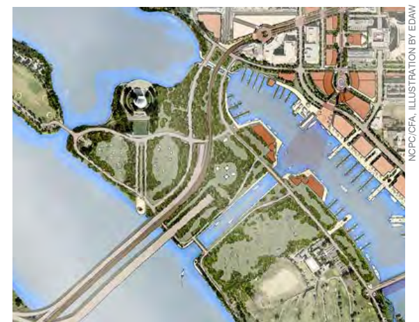
Illustration of proposed street-level improvements.