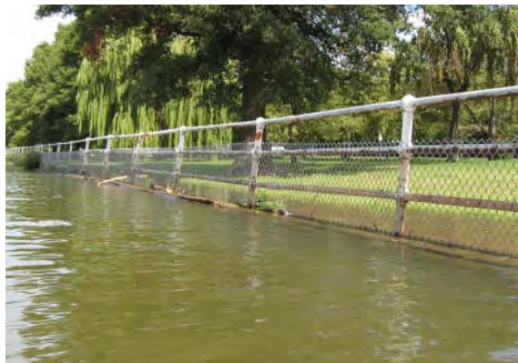
The Potomac Park seawall is sinking and needs repairs.

THE WATER'S EDGE Potomac Park's seawalls have subsided over the years from erosion and tidal fluctuation and pose a significant threat to public safety. The Framework Plan recommends varying treatments for the seawalls along the Potomac River and the Washington Channel.