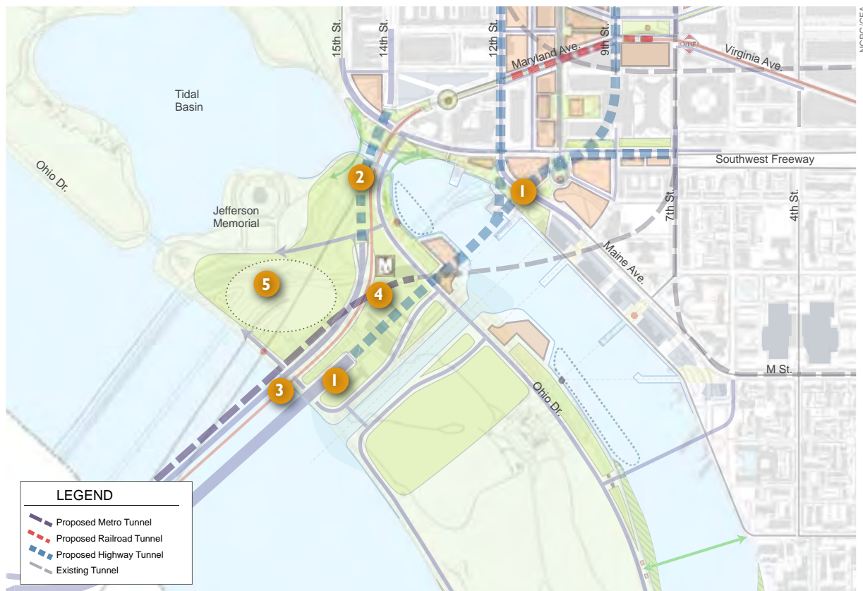
Proposed tunnels that will allow creation of the Jefferson Memorial Festival Green and connect Potomac Park to the National Mall.

The Framework Plan proposes that a new Metro station be constructed near the Jefferson Memorial to provide transit access to Potomac Park and the Southwest Waterfront, encourage the use of public transportation, and reduce the number of passenger vehicles entering the park. This new Metro station would also serve multiple destinations near the Tidal Basin, including the Thomas Jefferson, Franklin Delano Roosevelt, and Dr. Martin Luther King, Jr. Memorials. To make the station possible, the Metrorail tracks would need to be moved below ground. This would also remove what is now a significant visual and physical intrusion into Potomac Park.