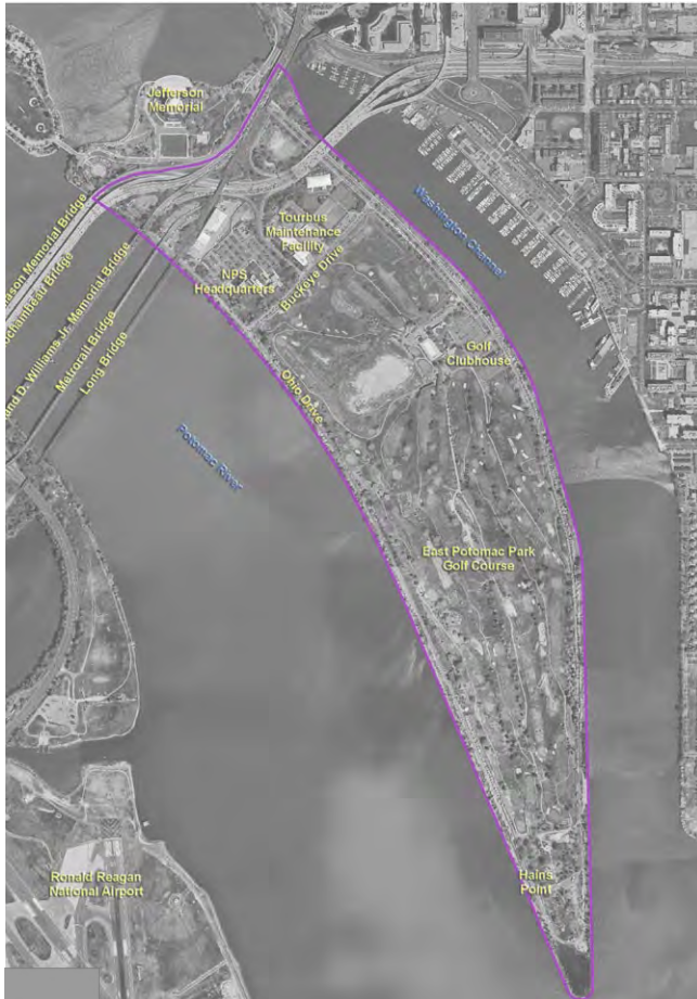
Aerial view of Potomac Park.