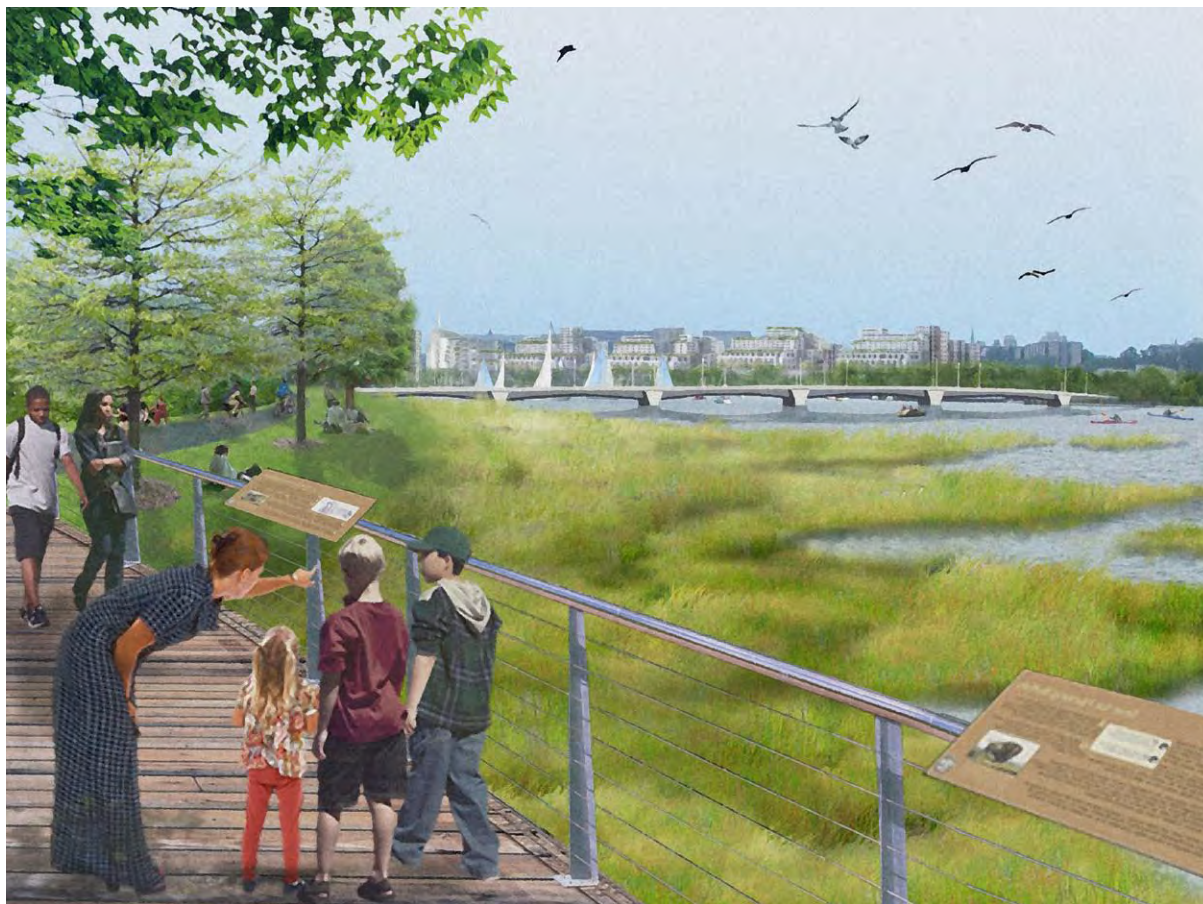
NOFCOFA ILLUSTRATION BY EDRAW

NEW MEMORIALS With its sweeping open spaces and water views, Potomac Park could provide excellent settings for several new memorials ranging in size and scope. Hains Point is one of the island's most promising commemorative sites. Several other important locations along the esplanade and shoreline could also accommodate small- and medium-scale memorials. These memorial sites will become especially desirable as the renewed Potomac Park landscape acquires its own unique identity and is linked to the rest of the city by enhanced transit, water taxi, and pedestrian connections.