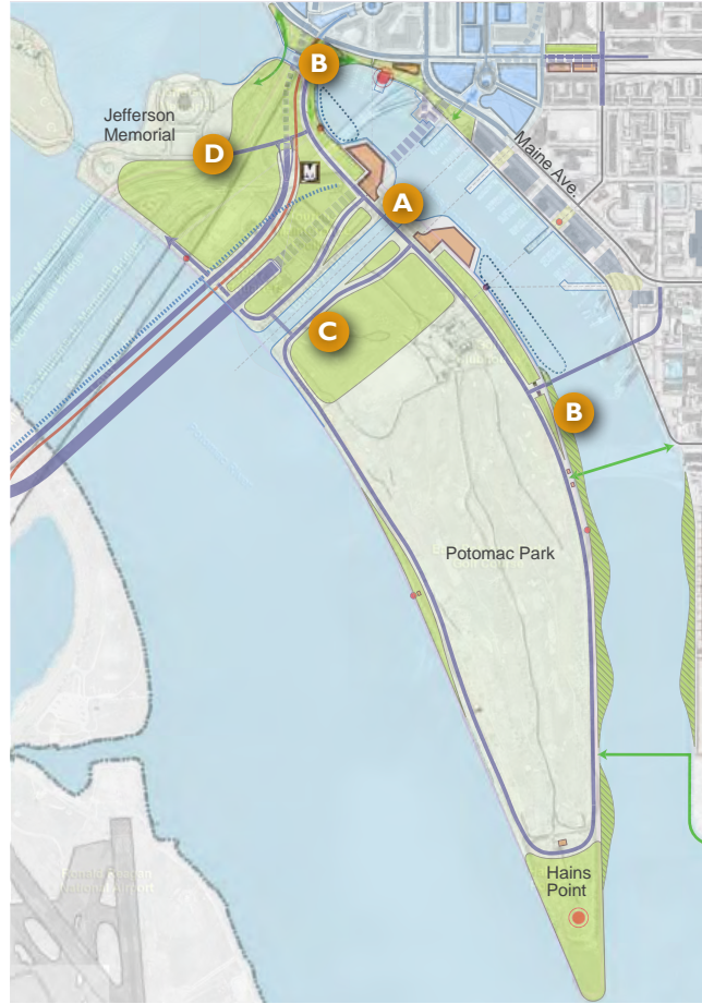
The Framework Plan proposal for Potomac Park.