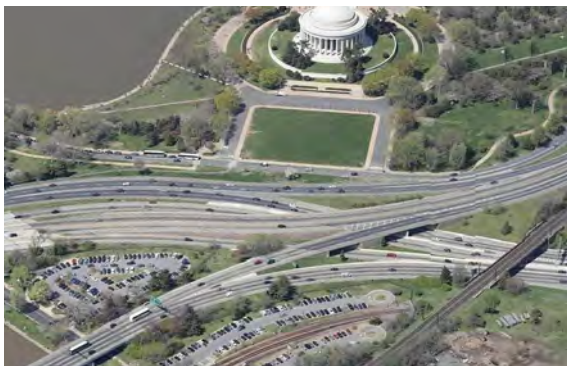
Current view of Jefferson Memorial, looking north from an existing parking lot.