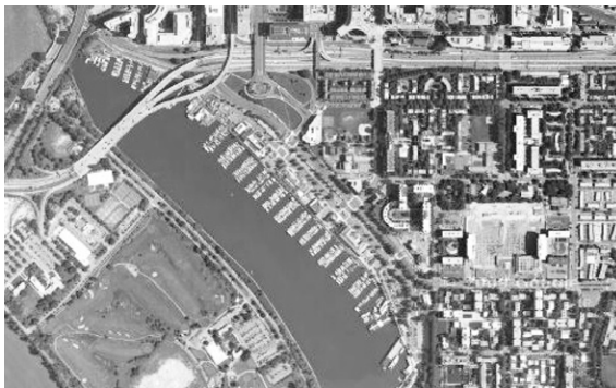
Aerial view of the Southwest Waterfront, Washington Channel, and Potomac Park.

EXPANDED LAND BRIDGE Pedestrians can now enter the park only along a narrow Tidal Basin walk or from an unpleasant walk beneath the I-395 bridge. Widening the sliver of land at the north end of the channel would improve access to the Tidal Basin and improve pedestrian and vehicular mobility between the city and the park, by providing greater separation between roadways, walkways, and railroad infrastructure. The land bridge would allow for a gracious waterfront promenade that could become a new gateway, creating a more inviting entrance to the park. An integral part of the proposed development, the promenade would help extend the character and experience of the National Mall and the new Southwest Waterfront into Potomac Park.