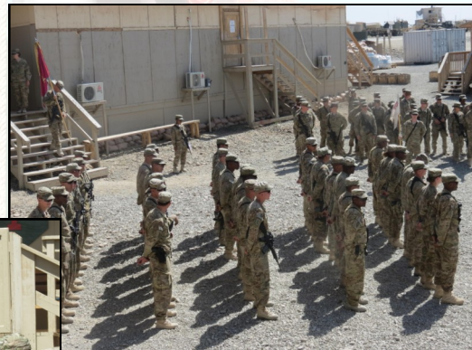
701st Awardees stand in formation