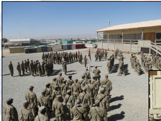
701st Soldiers stand in formation for Battalion Awards Ceremony on October 2nd