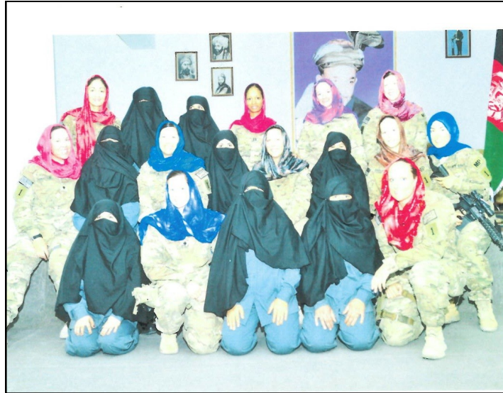
The Dragon Female Engagement Team poses with the first female members of the Afghan Uniformed Police in Paktika Province

It was an exciting and remarkable experience for the Task Force 701 FET members to help train these Afghan women. The mission was a great success and opened up a new era in Paktika history. Al-