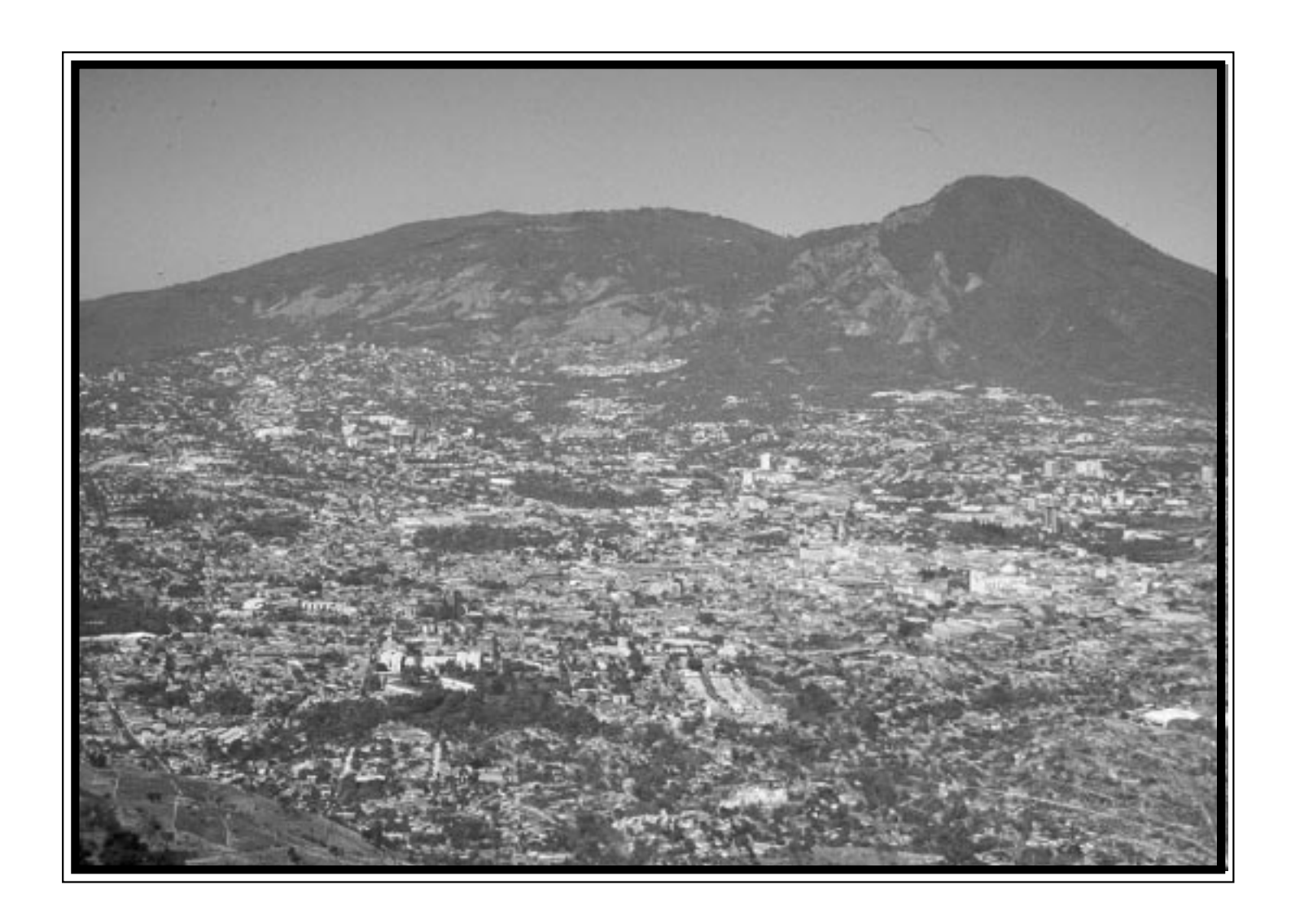
Open-File Report 01-366