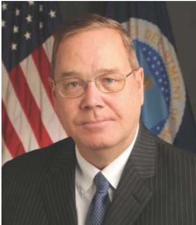
Under Secretary Rural Development Dallas Tonsager

The Obama Administration recognizes how important rural America is to the continued economic health and vitality of the United States. Rural communities are home to more than 50 million people. Rural America supplies much of our nation’s food and water, and safeguards our environmental heritage. Its role in establishing our nation’s