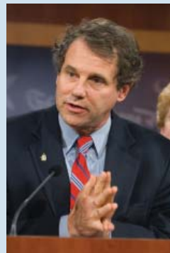
U.S. Senator Sherrod Brown

U.S. Sen. Sherrod Brown's support was pivotal in the award of more than $51 million in funding to expand high-speed Internet access in Ohio. The funding is distributed by the U. S. Department of Agriculture and U.S. Department of Commerce. Brown sponsored the Rural Broadband Act