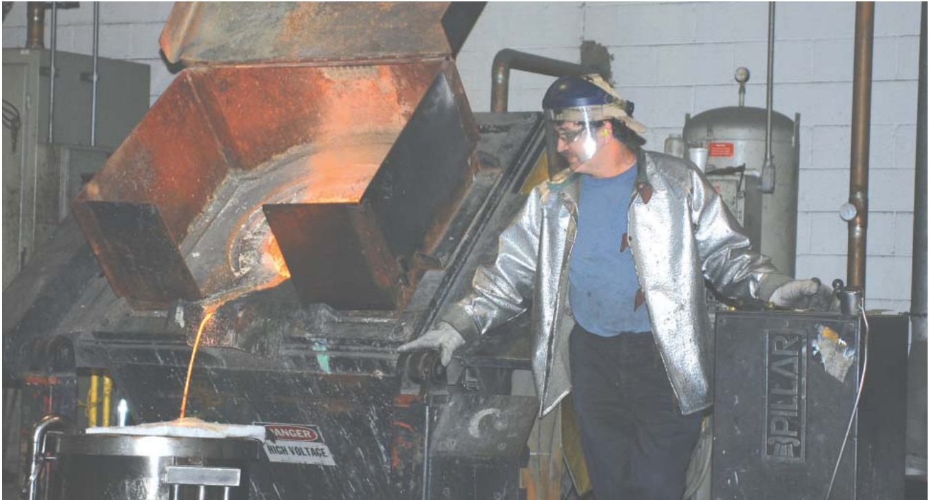
OPM smelter operator processes recycled metals and pours them into selected molds for cooling.

Ohio Precious Metals (OPM), a Jackson County metal refining company with roots dating back to 1974, received a $9,470,000 American Recovery and Reinvestment Act (ARRA) Guarantee loan through Rural Development's Business and Industry Guaranteed Loan Program. The loan was made through Peoples Bank of Lancaster, Ohio.