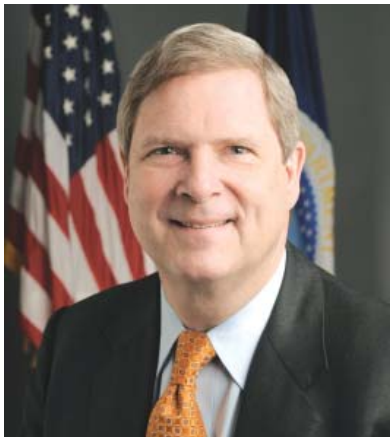
Secretary of Agriculture Tom Vilsack

When I assumed this office in January 2009, our country was struggling through the most serious economic crisis since the Great Depression. In rural America, the recession aggravated challenges that had been ignored or unsolved for decades. President Obama directed me to do everything possible to help jumpstart the national economy – and