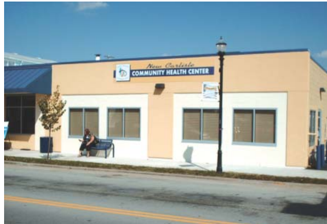
(Top photo) New Health Partners of Western Ohio facility purchased through Rural Development's CF Program. (Bottom photo) Ribbon cutting ceremony dedicating new facility for Ohio Genealogical Society funded through CF Program.

equipment and health and safety service centers.