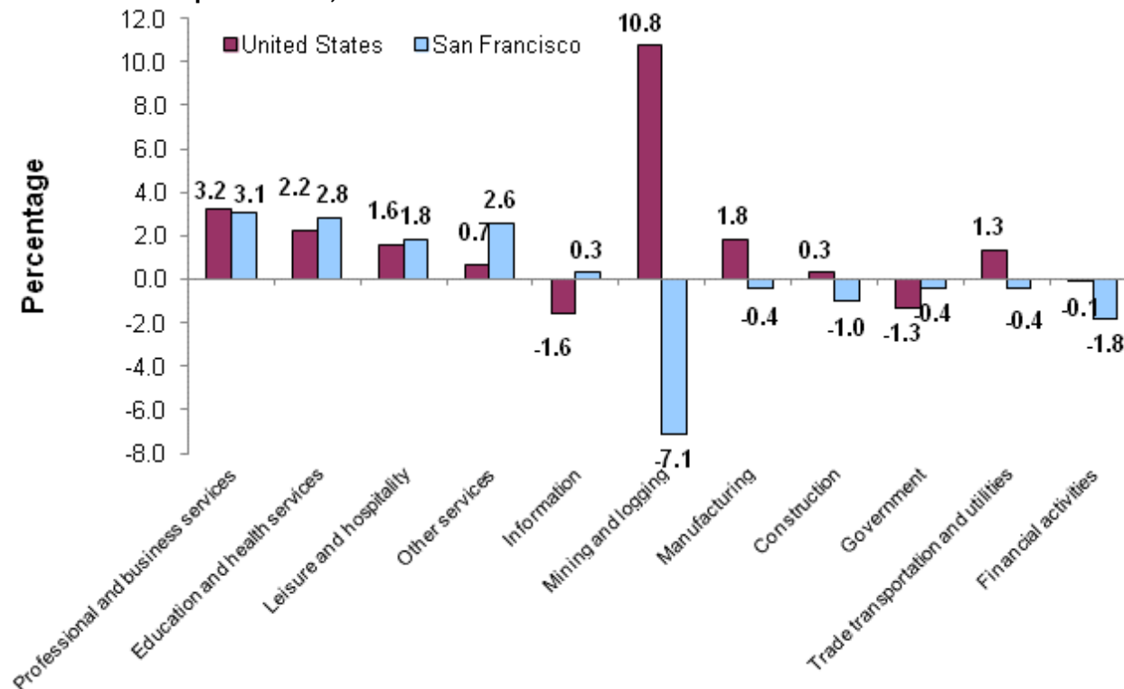
Chart 2. Over-the-year percent change in employment by industry supersector, United States and the San Francisco metropolitan area, October 2011

Locally, jobs in education and health services were up 7,100, or 2.8 percent, from the previous October. Of note, this industry was one of the few in the metropolitan area in which job gains were larger in the Oakland-Fremont-Hayward division than in the San Francisco-San Mateo-Redwood City division—4,800 versus 2,300.