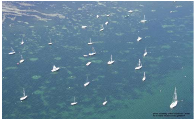
Impacts to eelgrass habitat from moorings