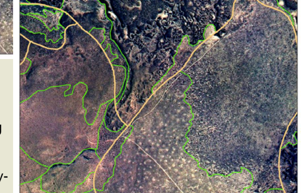
Ecological site associations Ecological states

Ecological site maps can be created by classifying soil map units to the dominant ecological sites occurring within them, or ecological site associations can be mapped.