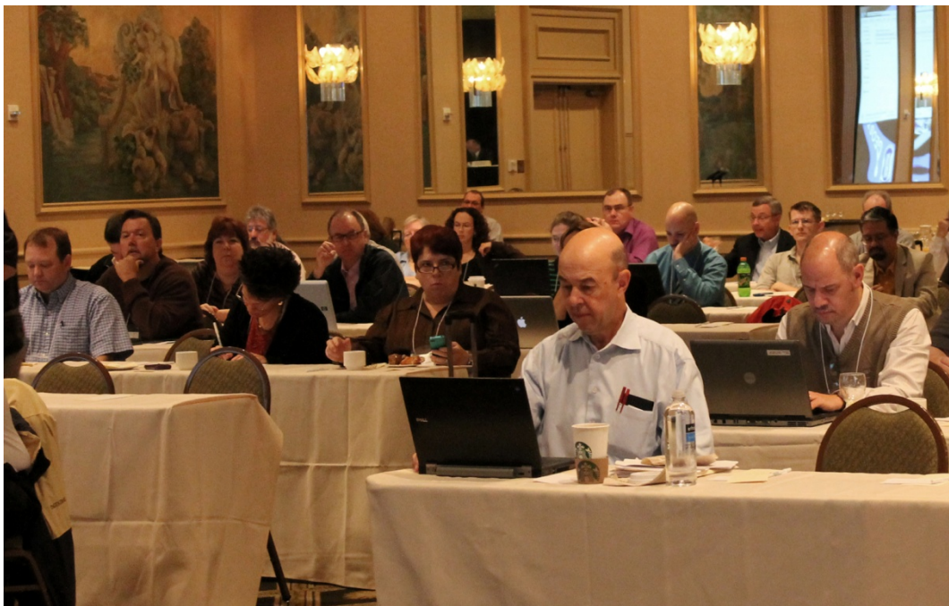
A captivated audience ready for discussion on important GOES topics