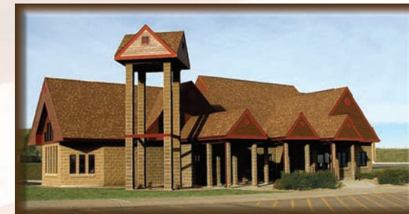
Cemetery Chapel and Visitor's Center