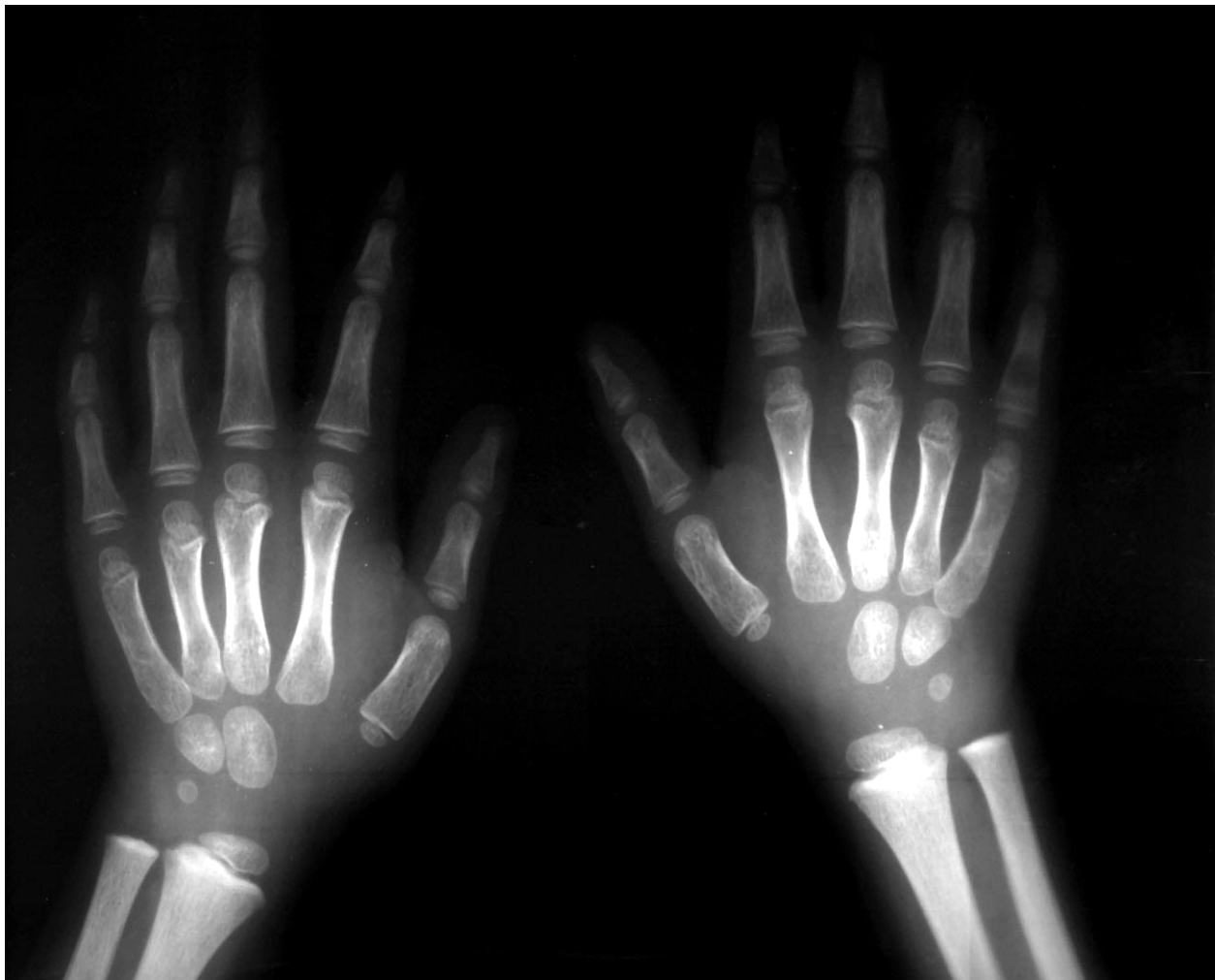
Figure 2. Longbone radiographs of hands

"Lead lines" in five year old male with radiological growth retardation and blood lead level of 37.7 \mu g/dL.