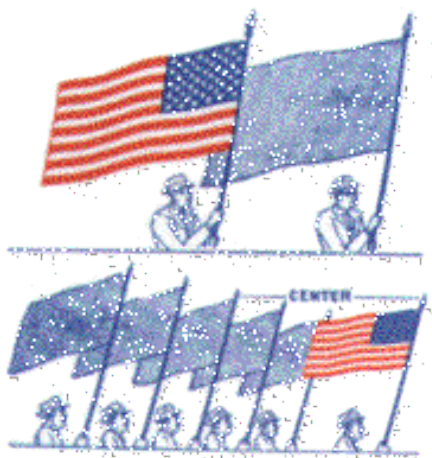
Carried in a Procession