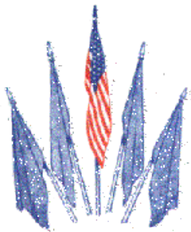
Displayed with Other Flags