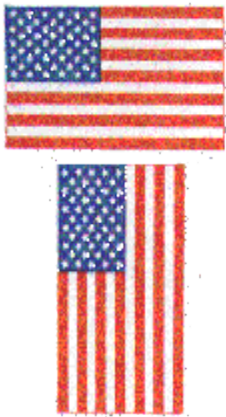
Against a Wall Horizontally Vertically