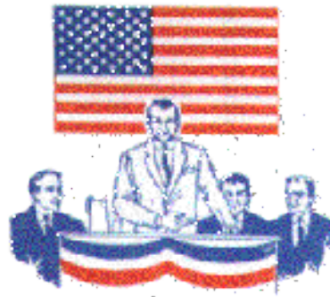
On Speakers Platform