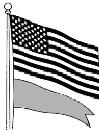
Flown on Same Halyard