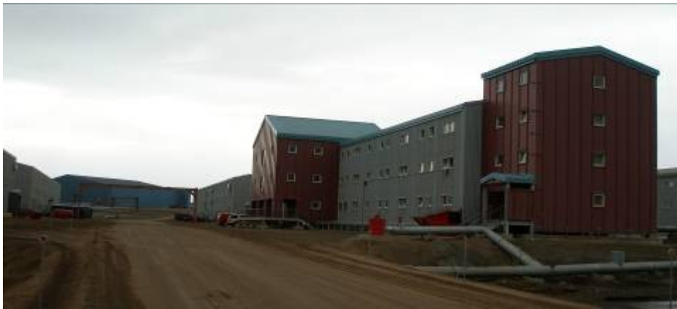
North Star Hotel

North Star Hotel (the only hotel) arraignments made by ESPO when we submit the country clearance request.