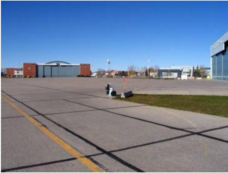
Aircraft Ramp Parking