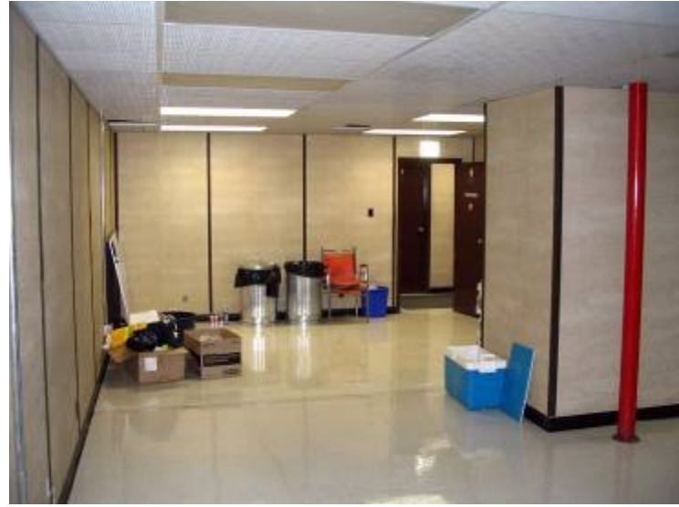
Office space example