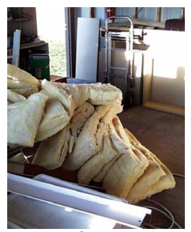
Figure 1. Stacked Insulation

hantaviruses is small when compared to SNV. Hantavirus is shed in rodent urine and feces. The primary route of infection, inhalation of airborne particles containing virus, is almost always associated with indoor environments.