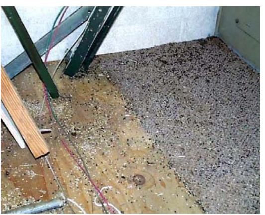
Figure 4. Heavy Rodent Contamination