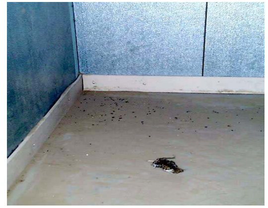
Figure 3. Light Rodent Contamination.

The various cleanup scenarios presented in the following text boxes illustrate the level of contamination, the cleanup methods, and the personal protection required. This information should be used as a general guide, subject to modification or change by Public Health personnel. Examples of light and heavy rodent contamination are shown in Figures 3 and 4.