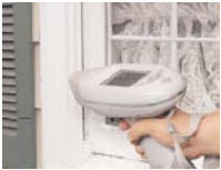
NITON's XLP 300 Series Lead Analyzer, pictured above, can measure the concentration of lead in paint even when covered by 50 or more layers of non-lead paint of unknown thickness and composition.

* Successful Phase 1 recipients can apply for a Phase 2 grant up to $225,000