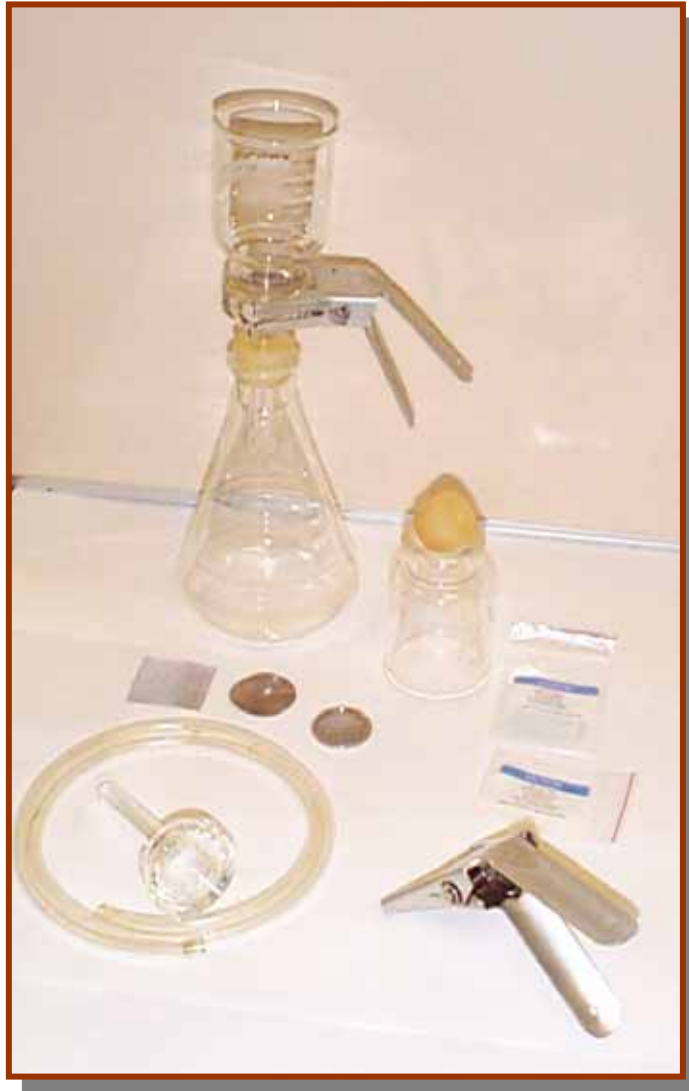
Figure 1. Vacuum filtration equipment.