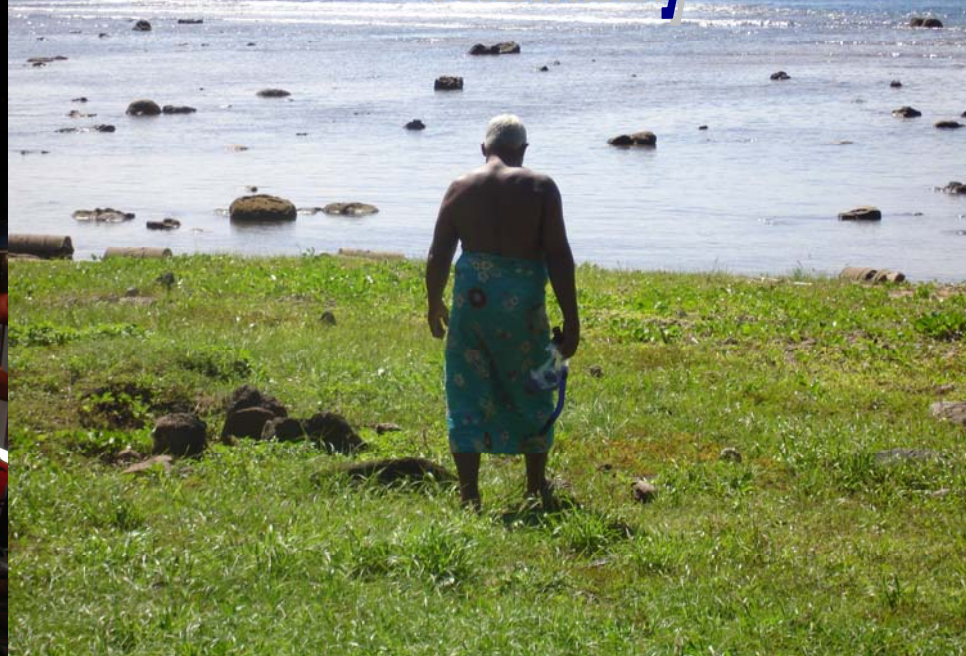
MPA Patrol - Community Site Visits