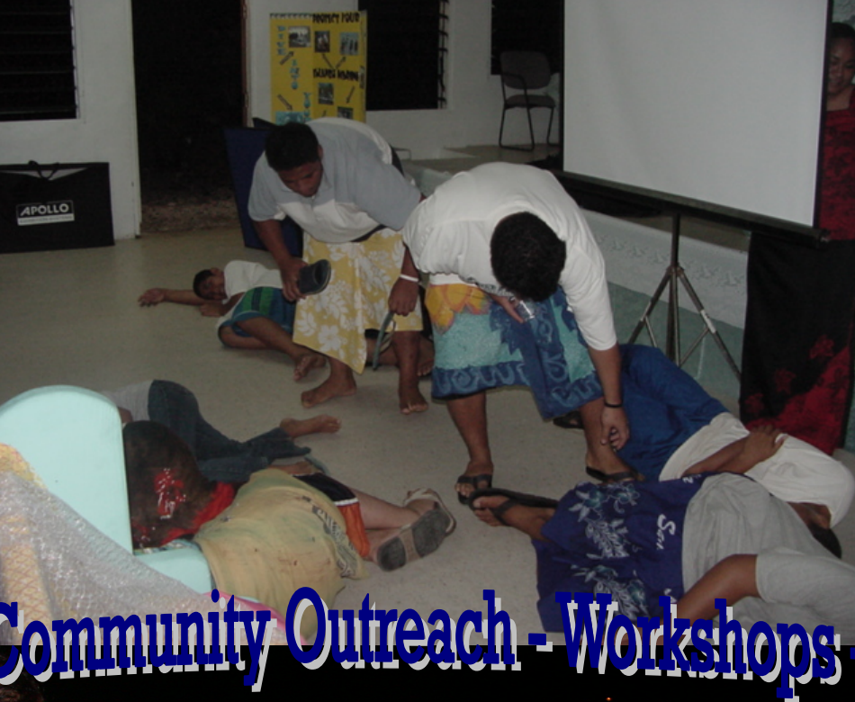
Community Outreach - Workshops