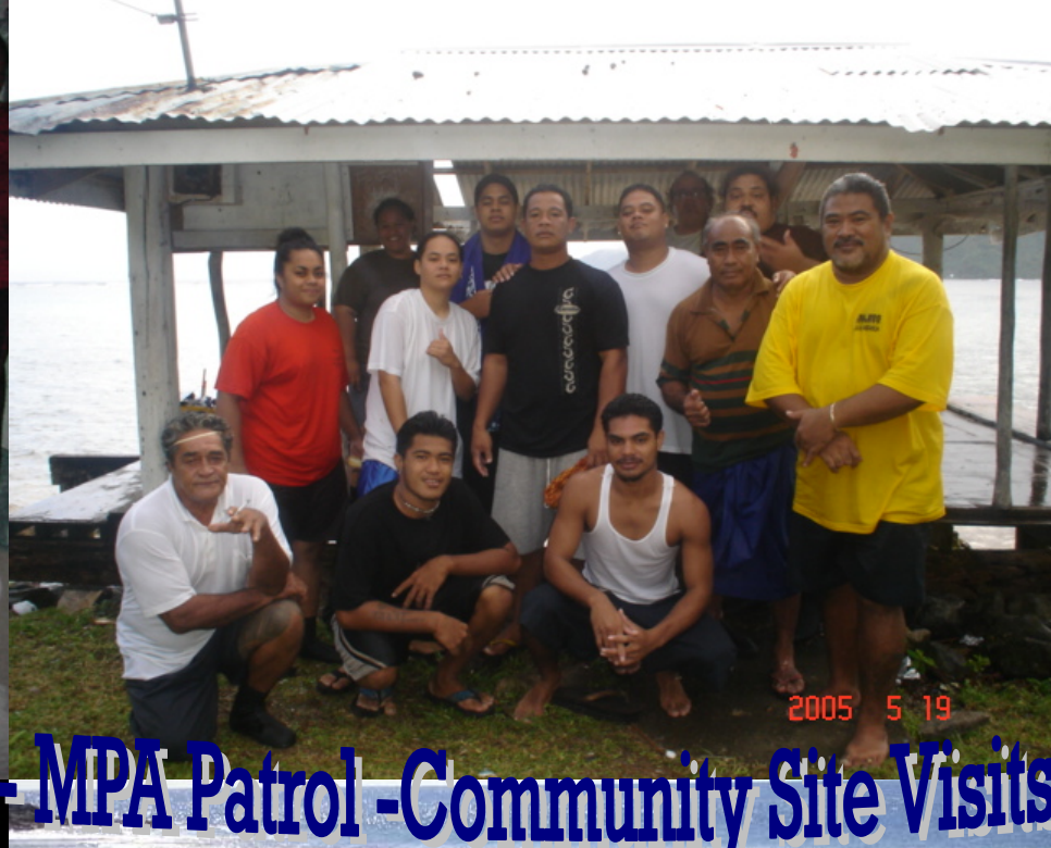
MPA Patrol - Community Site Visits