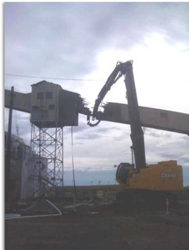
284E Powerhouse Conveyor Demolition

September 2010 DOE/RL-2008-69, Rev. 36 Contract DE-AC06-08RL14788 Deliverable C.3.1.3.1 - 1