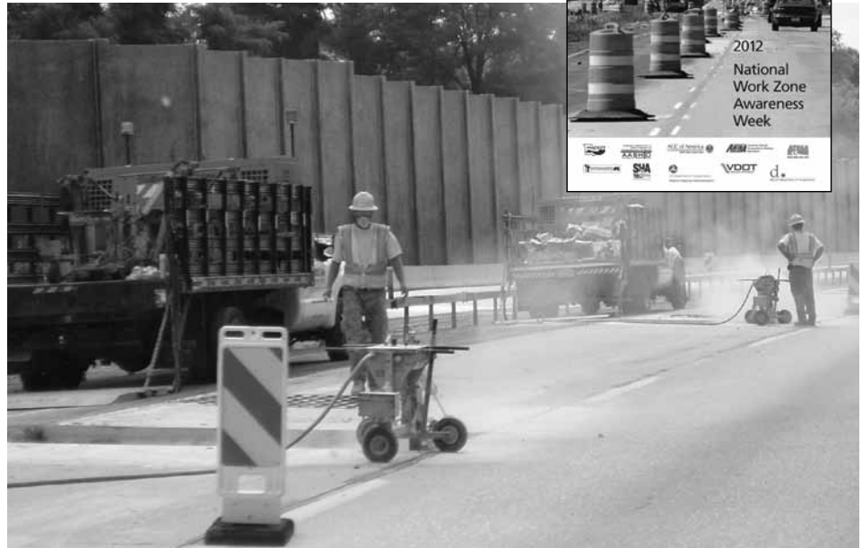
States across the country will kick off National Work Zone Awareness Week 2012 on April 23. Education and outreach campaigns stress the importance of protecting both workers and motorists.