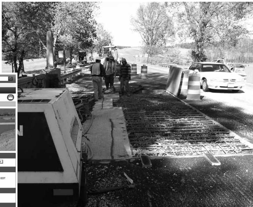
Bridge deck repairs are performed prior to installation of a deck overlay, which can reduce the impact of aging and weathering.

Legislation and Policies, Bridge Management, Bridge Preservation Treatments, and Research and Development.