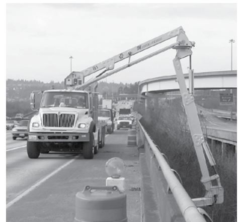
Top right: A visual inspection of a steel girder bridge is conducted. Middle right: An inspector conducts a visual inspection of a truss structure. Bottom right: An under-bridge inspection vehicle is used on an Interstate bridge. Bottom left: A visual inspection is carried out for a steel substructure unit.