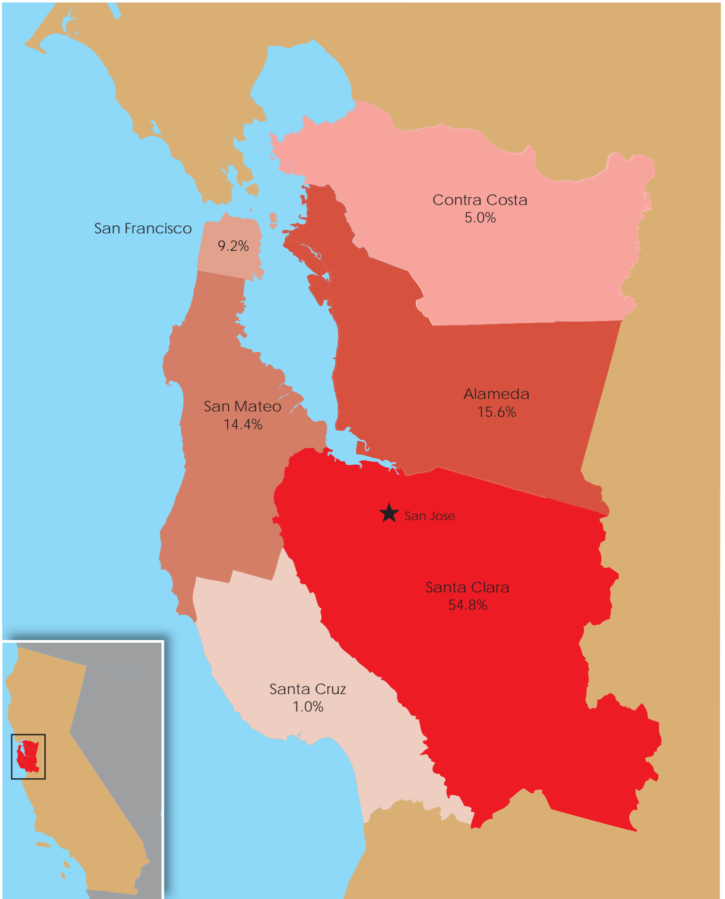
MAP 1. Distribution of high-tech employment in Silicon Valley by county, in 2008