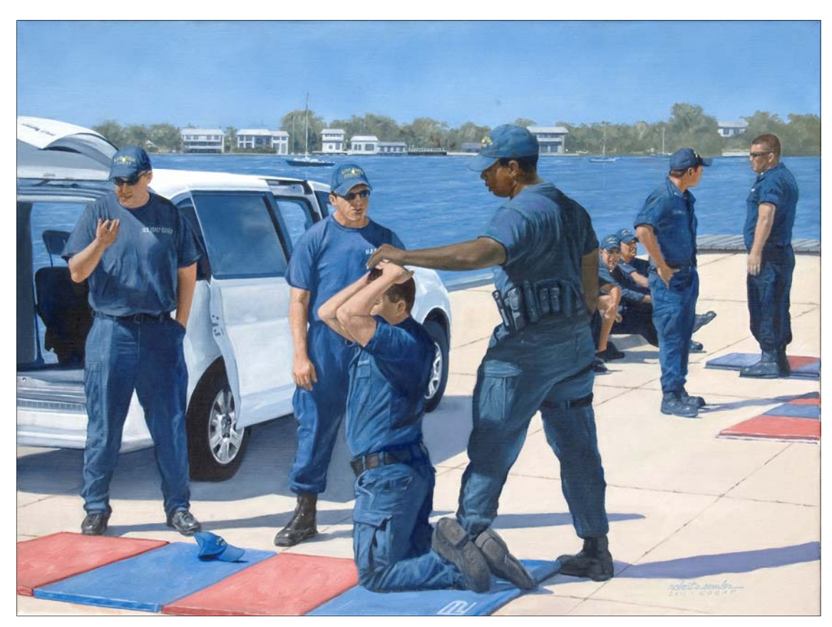
2011 George Gray Award Recipient

Cosponsored by the United States Coast Guard and the Salmagundi Club