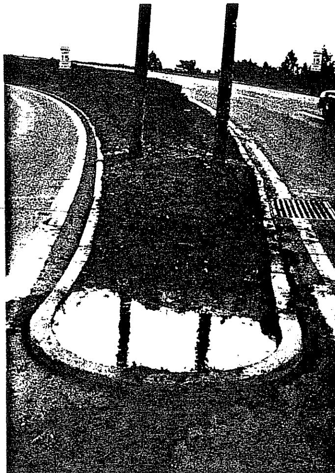
SIGN SUPPORTS SHOWING PREVIOUS IMPACT MARKS