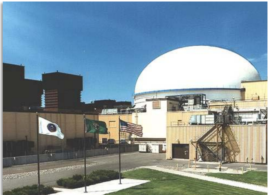
Fast Flux Test Facility