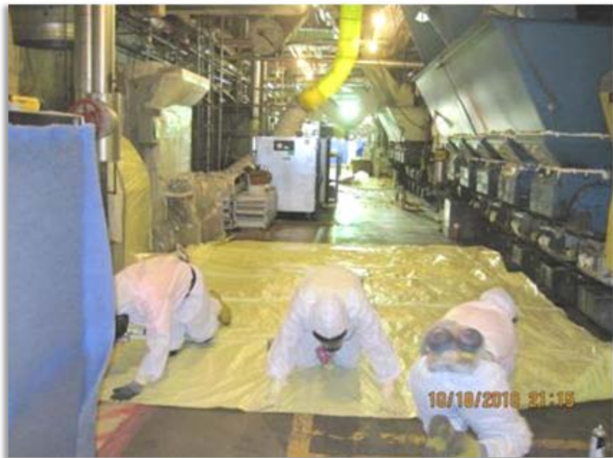
284E Powerhouse Asbestos Removal Preparations