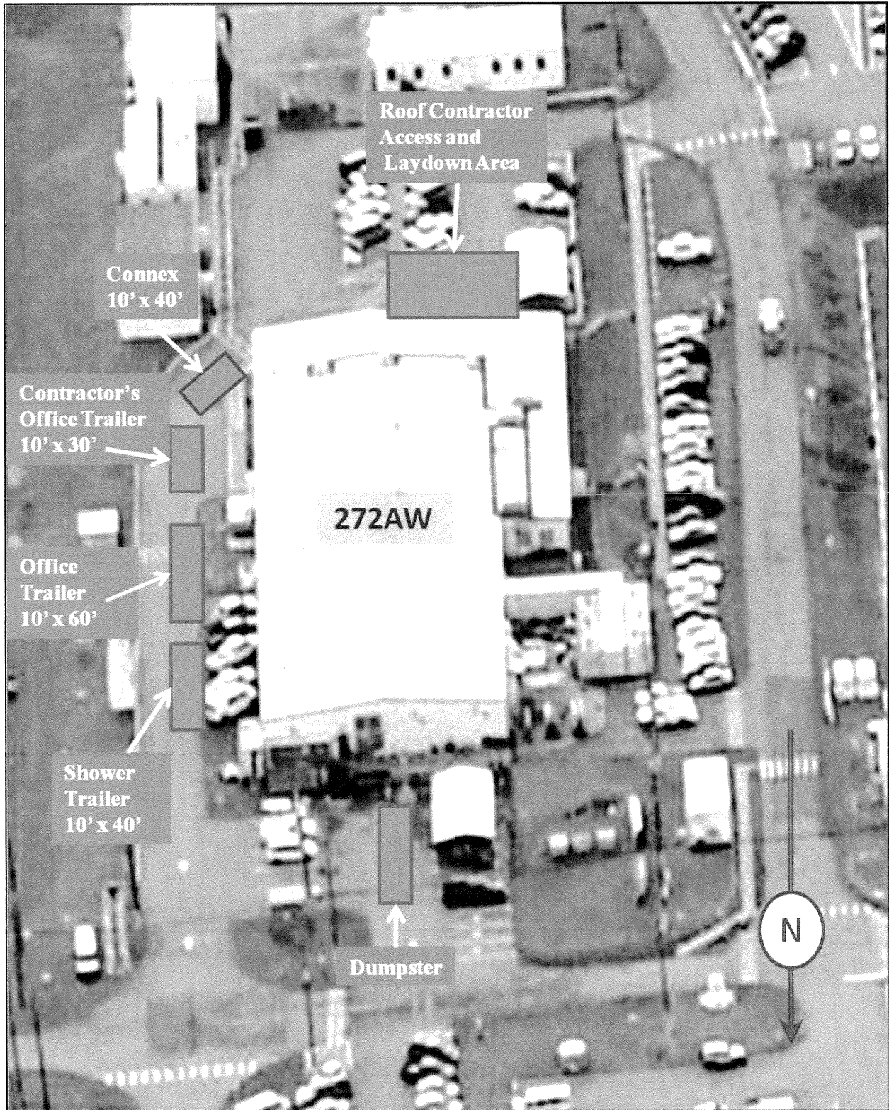
Figure 1. Aerial photograph showing an example of the relative locations of the temporary connex box, the three associated trailers, the dumpster, and the roofing contractor's laydown/staging area in relation to 272-AW.