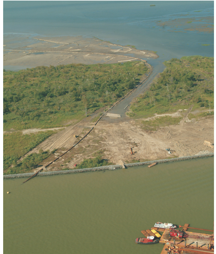
A dredge is being used to create marsh in the lower delta for the West Bay Sediment Diversion (MR-03) project. Work similar to this will take place during construction of the Benneys Bay project.

The diversion would induce shoaling in the main navigation channel of the Mississippi River. Dredging of the channel is accomplished under the U.S. Army Corps of Engineers' ongoing Operations and Maintenance (O&M) Program for the river. The Pilottown anchorage area is not maintained under the O&M Program. The additional dredging of the induced shoaling in the navigation channel and anchorage area would be an added feature and cost of the project. The dredge material removed from these areas will be used to create wetlands where possible.