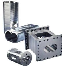
Improved Wear Capabilities