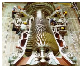
Component Blades and Coatings