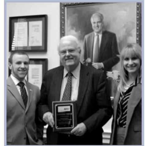
Congressman Sensenbrenner received the "Taxpayers' Friend Award" in May from the National Taxpayers Union, an independent tax watchdog group. The award honors his commitment to reducing or controlling federal spending, taxes, debt and regulation. Congressman Sensenbrenner received the highest score in the Wisconsin delegation, and was 13th overall in the House of Representatives, resulting in an 'A' grade. There are more than 7,500 NTU Members from Wisconsin.

U.S. HOUSE OF REPRESENTATIVES WASHINGTON, D.C. 20515-4905