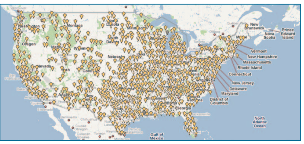
According to the AFDC Stations Count, there are more than 2,400 LPG stations available to fuel the country's more than 270,000 propane vehicles.