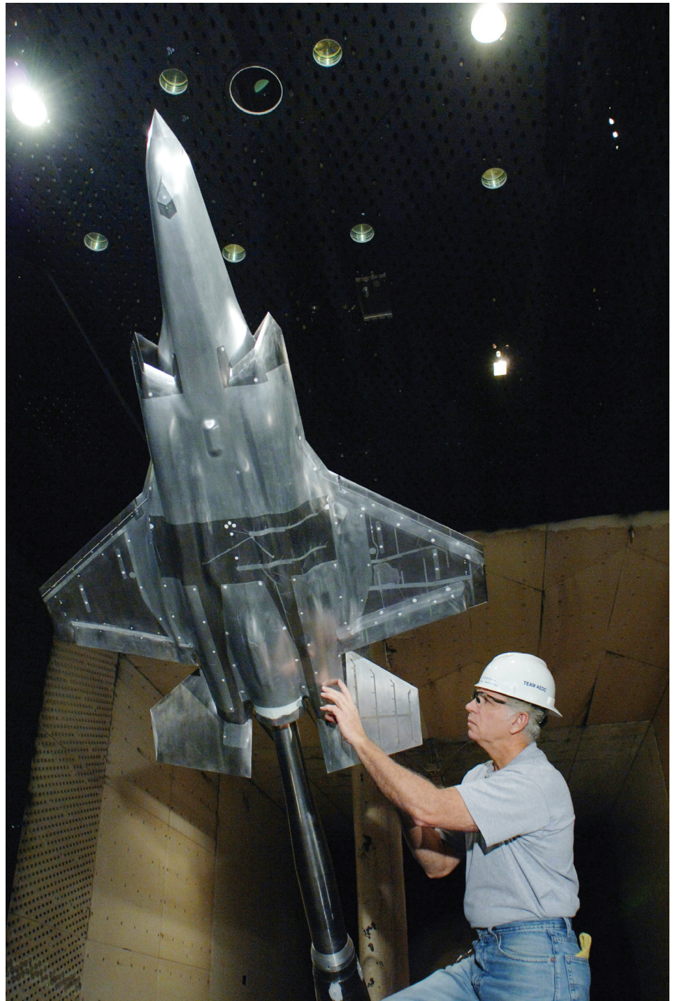
A Lockheed Martin engineer inspects a model of the F-35 Joint Strike Fighter Lightning II during a break in aerodynamics load testing in AEDC's 16-foot transonic wind tunnel in 2006. (File photo)

AEDC operates wind tunnels in two primary facilities on base: the Propulsion Wind Tunnel Facility (PWT) and the von Kármán Gas Dynamics Facility (VKF). AEDC