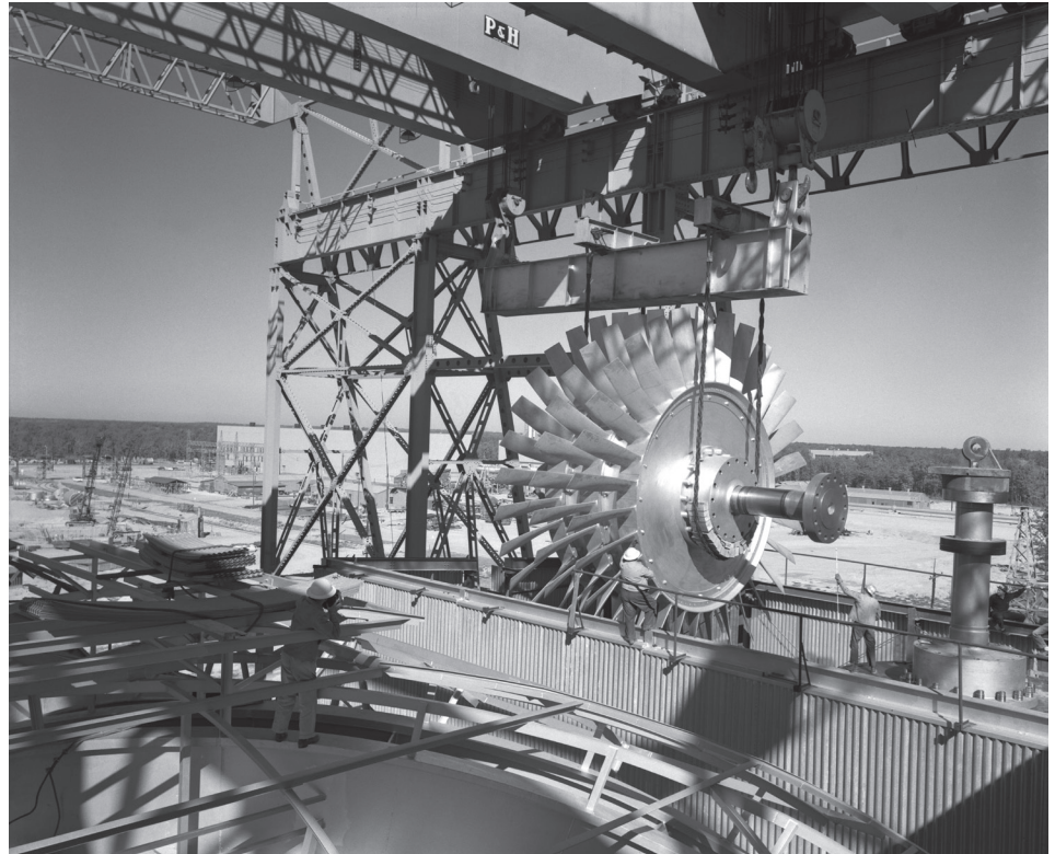
This 30-foot compressor rotor was installed in AEDC's 16-foot transonic wind tunnel Oct. 10, 1955. Today wind tunnel 16T is still used for a variety of tests. (File photo)

Prior to the advent of computers at AEDC in the 60s, much reliance was placed upon slide rules and tables of typical aerodynamic properties as part of the trade in preparing for tests, Peters said. Because com-