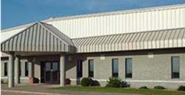
MetalQuest Unlimited Inc.

MetalQuest Unlimited Inc. was founded in 1995, with its first official day of business on January 1, 1996. MetalQuest first used a rented facility in Deshler, Nebraska and then moved in 1999 to its current location at Hebron, Nebraska.