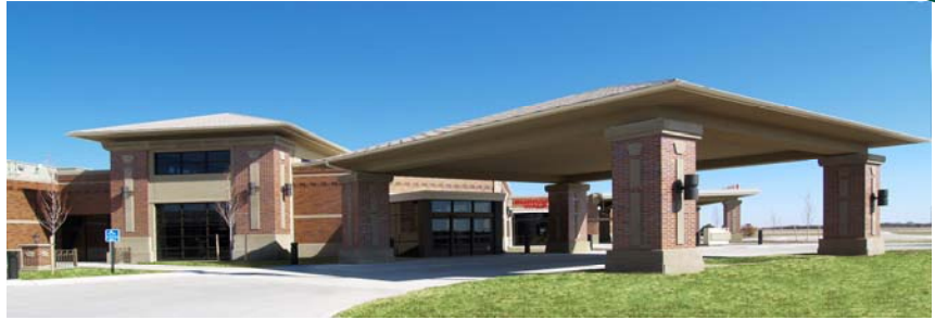
Fillmore County Hospital in Geneva celebrated its grand opening this year. USDA Rural Development provided a loan of $12.6 million through the American Recovery and Reinvestment Act. UMB Bank, N.A. of Kansas City, MO underwrote a $5.4 million bond issue and Fillmore County Hospital completed the funding with $500,000.

USDA Rural Development improves the quality of life in rural America through a variety of loan, grant and guarantee programs that assist water and wastewater systems, assisted living facilities, health care facilities, fire and rescue programs and community buildings such as libraries, city halls and recreation centers.