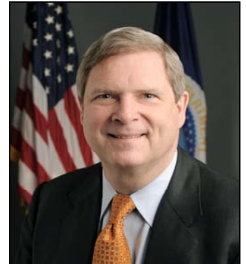
Tom Vilsack Secretary of Agriculture

“We have much to celebrate in Fiscal Year 2012. Overall, USDA Rural Development leveraged more than $30 billion in investments toward projects in rural communities. Many are the result of grassroots collaboration and creative partnerships between USDA employees and local organizations, governments, Tribes or individuals. It’s amazing what these partnerships can achieve. Even relatively small amounts of financing can have lasting impacts for those in need.”