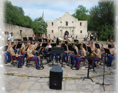
Marine Corps Band New Orleans Concert Band performs in front of The Alamo in San Antonio Texas.

The Marines also appeared in the Battle of Flowers parade and the Fiesta Flambeau parade. The crowds rose to their feet as the Marines marched through the city of San Antonio as the sound of New Orleans jazz filled their ears.