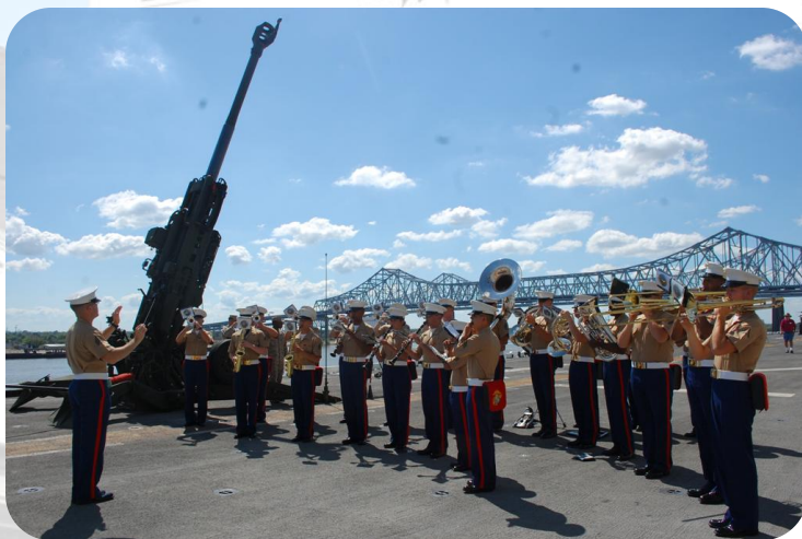
Marine Corps Band New Orleans ceremonial band performs aboard the U.S.S. Wasp

This year between April 17 and 23 the Marine Corps Band New Orleans participated in the 1812 Navy Week. This year’s Navy Week in New Orleans kicked off a three-year national celebration commemorating the 200 th anniversary of the War of 1812.