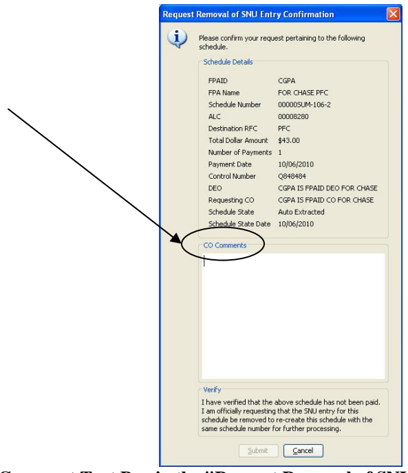
Figure 3: Comment Text Box in the "Request Removal of SNU Entry Confirmation" popup

In addition, Certifying Officers, at the time of making a Schedule Number Reuse Request, can enter comments to describe the reason for making such a request (for example, "Payment Amount was incorrect") to help your RFC to process the request expeditiously. See Figure 3.