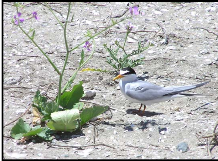
California Least Tern on new substrate.

This project has created new nesting habitat at Alameda Point for the endangered California Least Tern by enlarging the nesting area and installing protective fences. The newly created habitat is being monitored by removing undesirable vegetation, repairing protective fencing, and adding nesting substrate where needed.