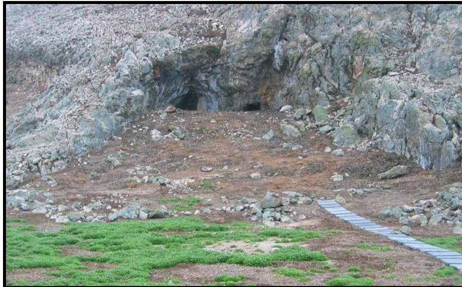
Test plot location. Lower portion reseeded with maritime goldfields.