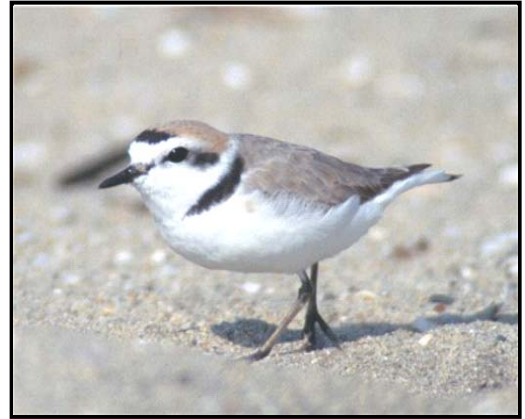
Western Snowy Plover.

Golden Gate National Recreation Area (GGNRA) previously installed 12 interpretive and regulatory signs at major beach entrances to inform the public of the presence of Western Snowy Plovers and other shorebirds, and the vulnerability of the birds to disturbance by humans and recreational activities. In addition, an interpretive bulletin on protecting Western Snowy Plovers, shorebirds, and sandy beach habitat was distributed to the public. This project will allow updating and replacement of damaged or missing signs and updating and re-printing of interpretive bulletins for up to 10 years. This project has recently been updated to include design and installation of a broader range of signage and the implementation of a shorebird docent program.