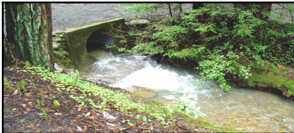
Culvert replacement at McGarvey Gulch to improve Steelhead passage.

McGarvey Gulch: The McGarvey Gulch culvert replacement was completed in 2007. Final designs, CEQA, and permits were finished in the spring, and the culvert was built in September 2007.