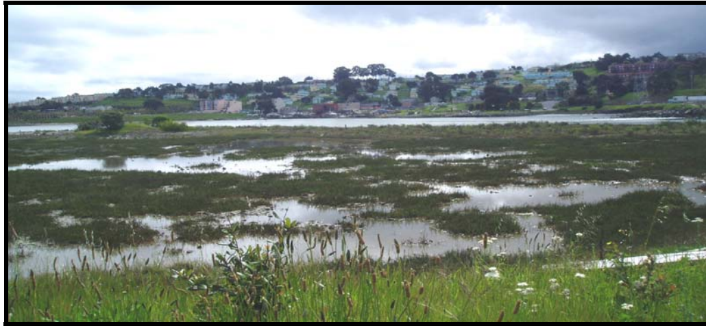
A new salt marsh is enhanced by propagating and planting rare transition-zone native plant species.

included in the Cape Mohican Final Restoration Plan (approved 3/21/02). The scope of work is consistent with the original proposal, but the fees are substantially higher. The contract includes installation of 2,000 transition-zone plants within the first two years of the contract, and ongoing maintenance and monitoring of the enhancement area over the 4-year contract term. The Port is committed to completing the scope of work and will fund any expenses that exceed funds available from the Cape Mohican Restoration Fund.