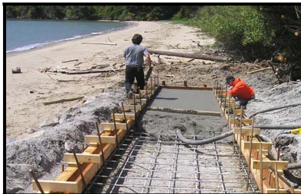
ADA ramp construction at Quarry Beach.

The Quarry Beach access has been completed. The additional work needed on the trail leading to the Perle's Beach stairs as well as stabilization at the top of the stairs will be performed pending the scheduling of other work in the area.