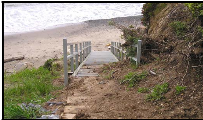
Stairs to Perle's Beach.

This project involves the construction of stairways, walkways, and trail improvements to enhance public access to beaches on Angel Island that were closed to the public because of the oil spill.