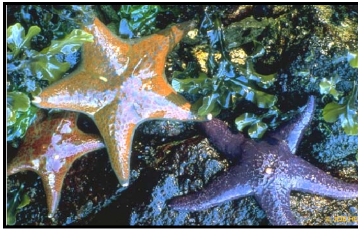
Sea Stars at Duxbury Reef Marine Reserve.

In 2007, Phase I work included completing regularly scheduled transect surveys in early spring and late summer. Completed sampling consists of two years of data collections (four baseline surveys) prior to implementing Phase II. The trail routing plan for Phase II has been completed but not implemented. Visitor count surveys associated with Phase II continued in 2007 with analysis in progress. The request for proposals to implement the Phase II managed access docent program remained in preparation in 2007.