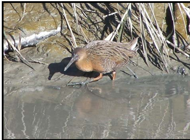
Expanded foraging area available for clapper rail after invasive Spartina control.

Habitat® herbicide, with the active ingredient imazapyr, was used for all control work in 2007. In July through September 2007, the fourth consecutive year of control work was conducted in the Southeast San Francisco Sub Areas, totaling 2.0 acres of non-native Spartina treatment. In addition, the third year of consecutive treatment was conducted at two sites: West San Francisco Bay (Site 19) and Alameda/San Leandro Bay (Site 20), totaling approximately 150 acres.