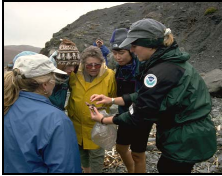
Environmental education at Duxbury Reef Tidepool.

This project will help prevent further injury to, and facilitate the natural recovery of intertidal rocky habitat at Duxbury Reef Marine Reserve. This will be achieved through an environmental education and stewardship program aimed at increasing public awareness of this sensitive habitat and controlling the large number of visitors to the area. The project will create opportunities for intertidal populations to recover from human-induced disturbances.