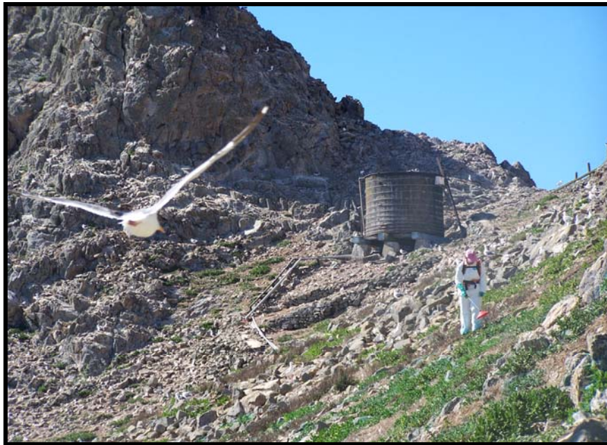
USFWS spraying Habitat® herbicide on New Zealand Spinach.

A hand re-seeding component that was added in 2005 continued in 2006 and 2007. Native Lasthenia plants were collected in August and September and seeded in late fall after the first rains. Areas seeded have improved the effectiveness of getting natives established and reducing the competition of non-natives, but this was only done on a small scale due to funding limitations. The three additional years of funding, 2008-2010, will allow reseeding to expand to additional areas. Several test plots were established to test the reestablishment of the Lasthenia in areas that had been treated with the new herbicide. Test plots were divided three ways representing the different treatments used on the island. Results should provide an indication of the overall effectiveness of the various treatments and the success rate for the reseeding efforts.