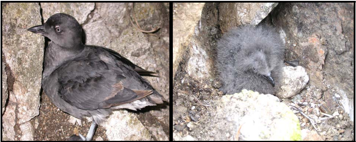
Cassin's Auklets (at burrow entrance, left) and Ashy Storm petrels (right) have benefited from this project. Invasive weeds cleared from nesting crevices and burrows allow Cassin's Auklets to find burrow entrances and enable nestling petrel chicks to flourish.