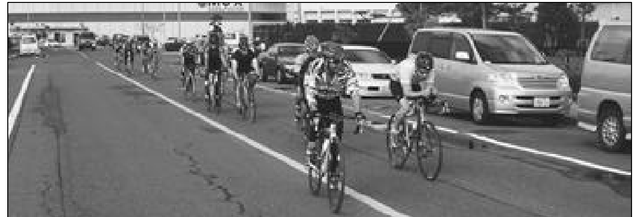
Bikers race to the finish line in the last event of Energy Awareness Week, Oct. 30. Station Energy Conservation officials hosted the Energy Awareness Week which culminated in a 5k run, a kids 5k bicycle race and a 38k bicycle race.