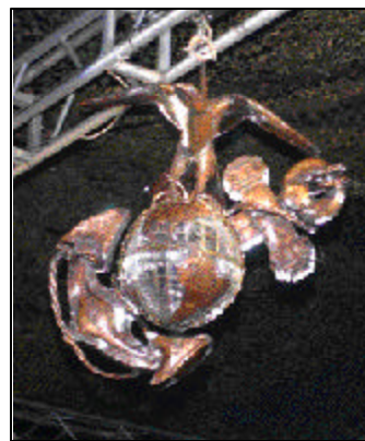
Marine Corps Community Services unveiled this specially made Eagle, Globe and Anchor decoration crafted from brass and copper.