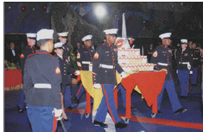
The cake cutting detail marches the birthday cake through the line of escorts.